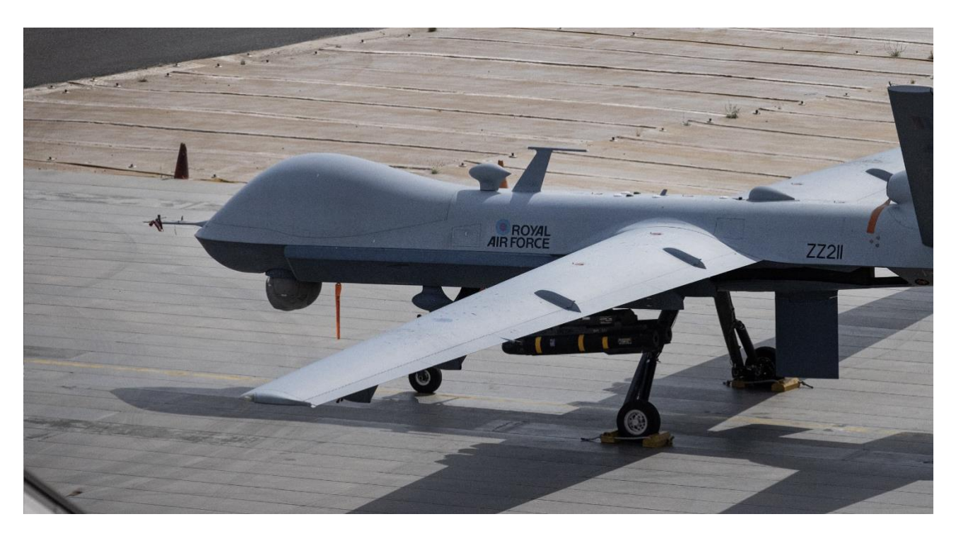
The MQ-9 Reaper, in service with the RAF since 2007, will be replaced by the world-class MQ-9B Protector.