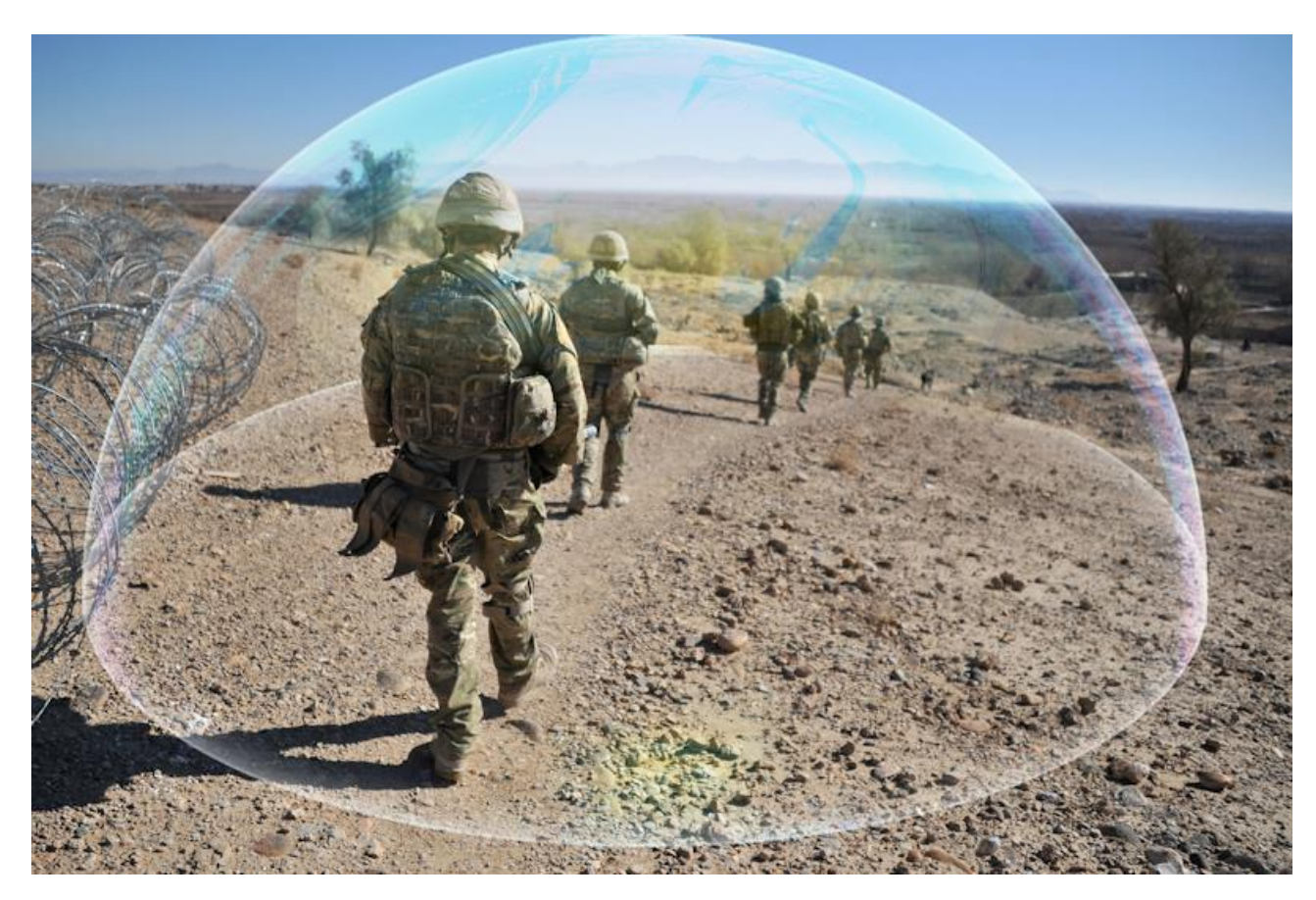
CRENIC, providing protection to deployed forces from Remote Controlled Improvised Explosive Devices (IEDs)