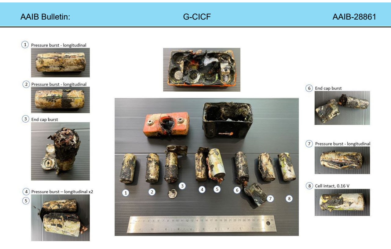
Figure 4 Damaged parts of the battery