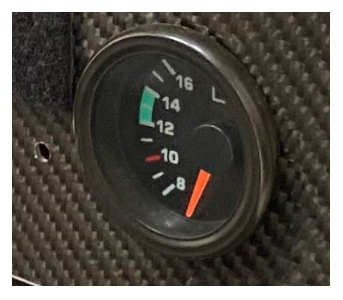
Figure 2 Voltmeter fitted to G-CICF, showing green band marking between 12.0 and 14.0 V

The aircraft was originally equipped with a 12 V sealed lead-acid battery, which had a mass of 2.7 kg. This was replaced in October 2016 with a new LiFePO4 lithium-ion battery<sup>2</sup> of slightly smaller external dimensions and a mass of 0.85 kg, providing a payload increase of 1.85 kg. The battery change was the subject of a standard BMAA Minor Modification (Technical Information Leaflet (TIL) 117). The modification required provision of a means for the pilot to isolate the battery from the charging circuit, which in G-CICF was met by the battery master switch. The completed modification paperwork also included confirmation that the aircraft had a voltmeter fitted to the instrument panel 'marked for overcharge condition' . This analogue voltmeter (Figure 2), had a marked range of 8.0 to 16.0 V, with a green band between 12.0 and 14.0 V.