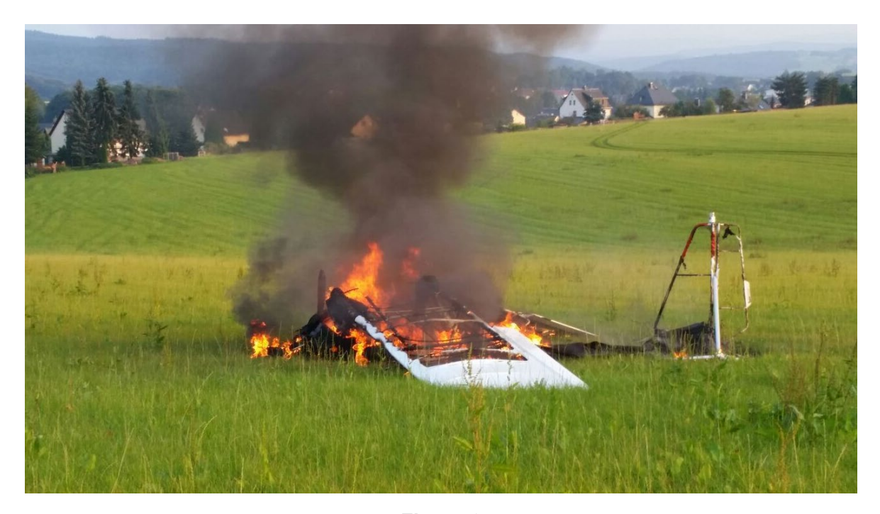
Figure 6 Ikarus C42 lithium-ion battery fire in Germany

The AAIB is aware of a second lkarus C42 lithium-ion battery fire that occurred in Germany. This aircraft was fitted with the same model of battery as G-CICF and was also not equipped with an OVP device in the battery charging circuit. The aircraft was being flown solo when a battery fire occurred in flight. The pilot made a forced landing in a field and was not injured. The fire continued after the aircraft landed, eventually destroying the aircraft (Figure 6).