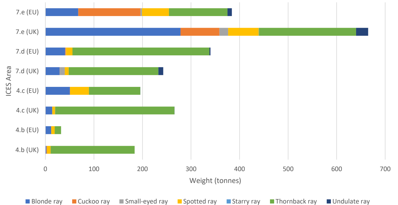
Comparison of UK (Including Crown Dependencies) and EU27 Annual Mean Skate and Ray Landings by Weight (tonnes) across FMP Area 2012-2022