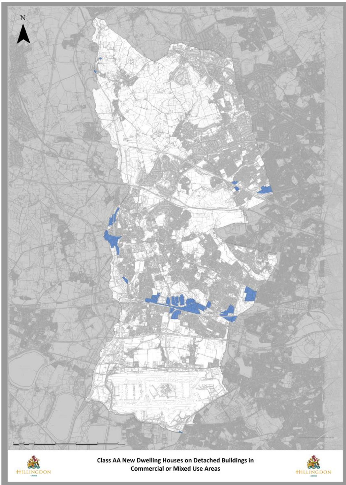
Map 1: Class AA, London Borough of Hillingdon