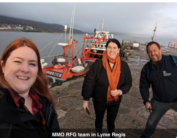
MMO RFG team in Lyme Regis

It was held face-to-face in Lyme Regis on Wednesday 31 January, facilitated by an independent facilitator and had over 30 attendees, with representatives from each commercial gear type, various fishing organisations and Producer Organisations (POs) & from the recreational sector.