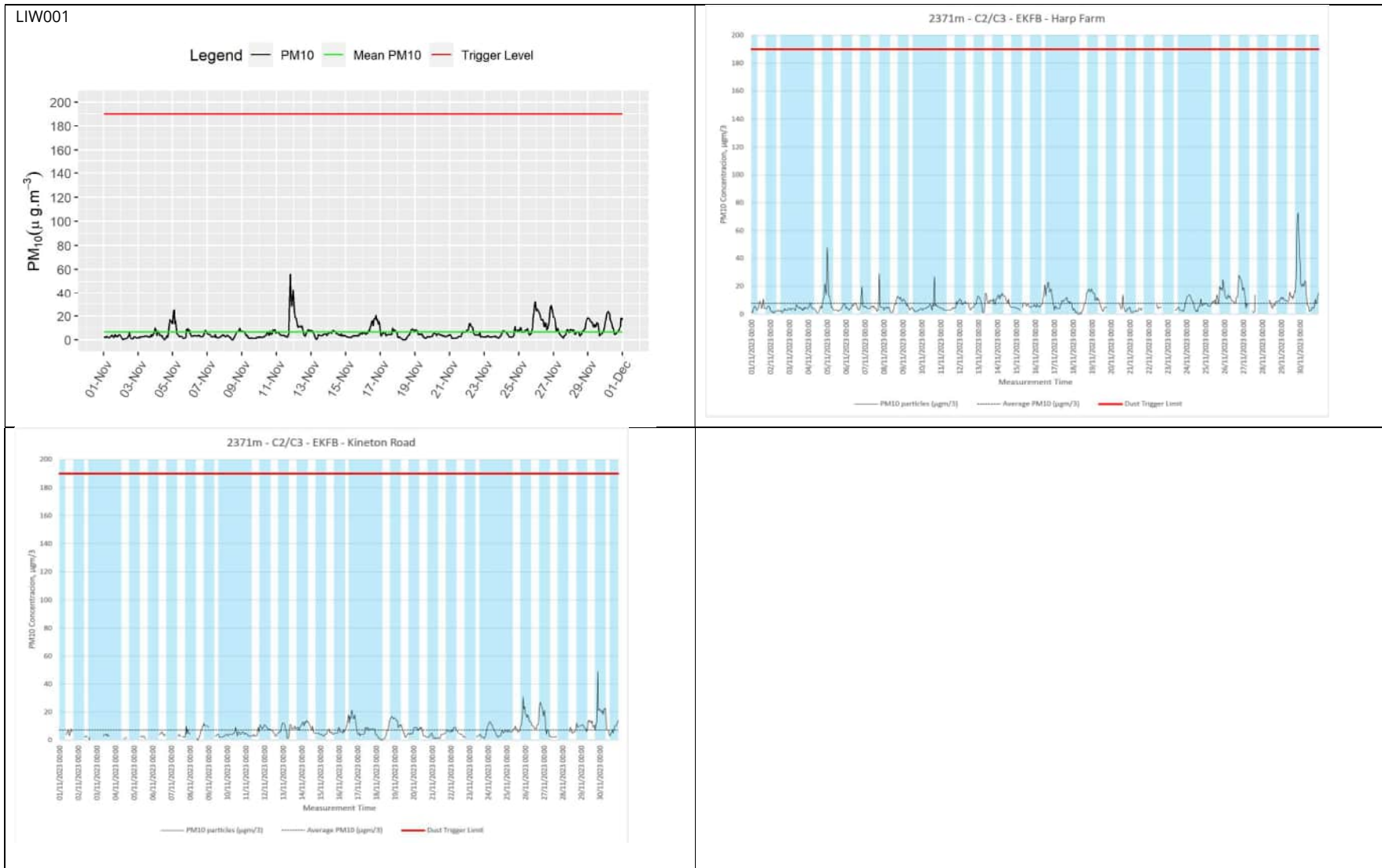
Air Quality and Dust Monitoring Summary Report, November 2023 Stratford-on-Avon District Council Figure 2: Construction dust 1-hour mean indicative PM 10 concentration for all dust monitors