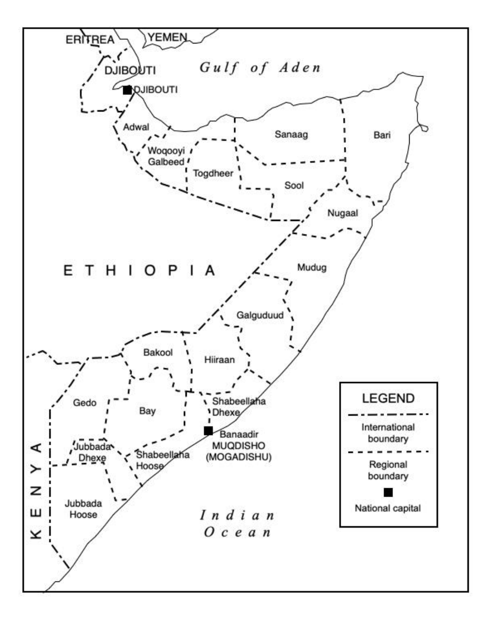
Map produced by PCGN for illustrative purposes only, and is not to be taken necessarily as representing the views of the UK government on boundaries or political status.