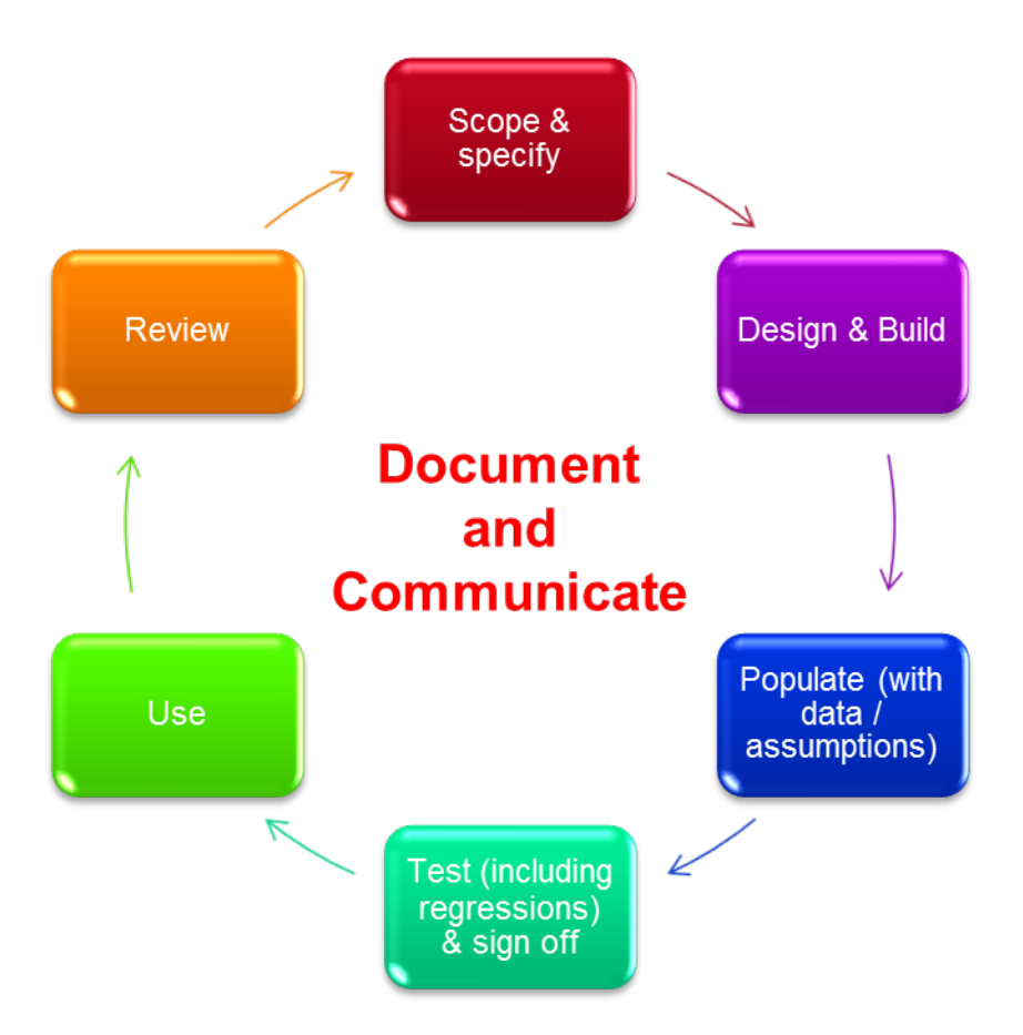
Figure 2: A visual representation of the model creation cycle

Figure 2 shows a visualisation of a modelling cycle, and the individual sections are detailed further below.