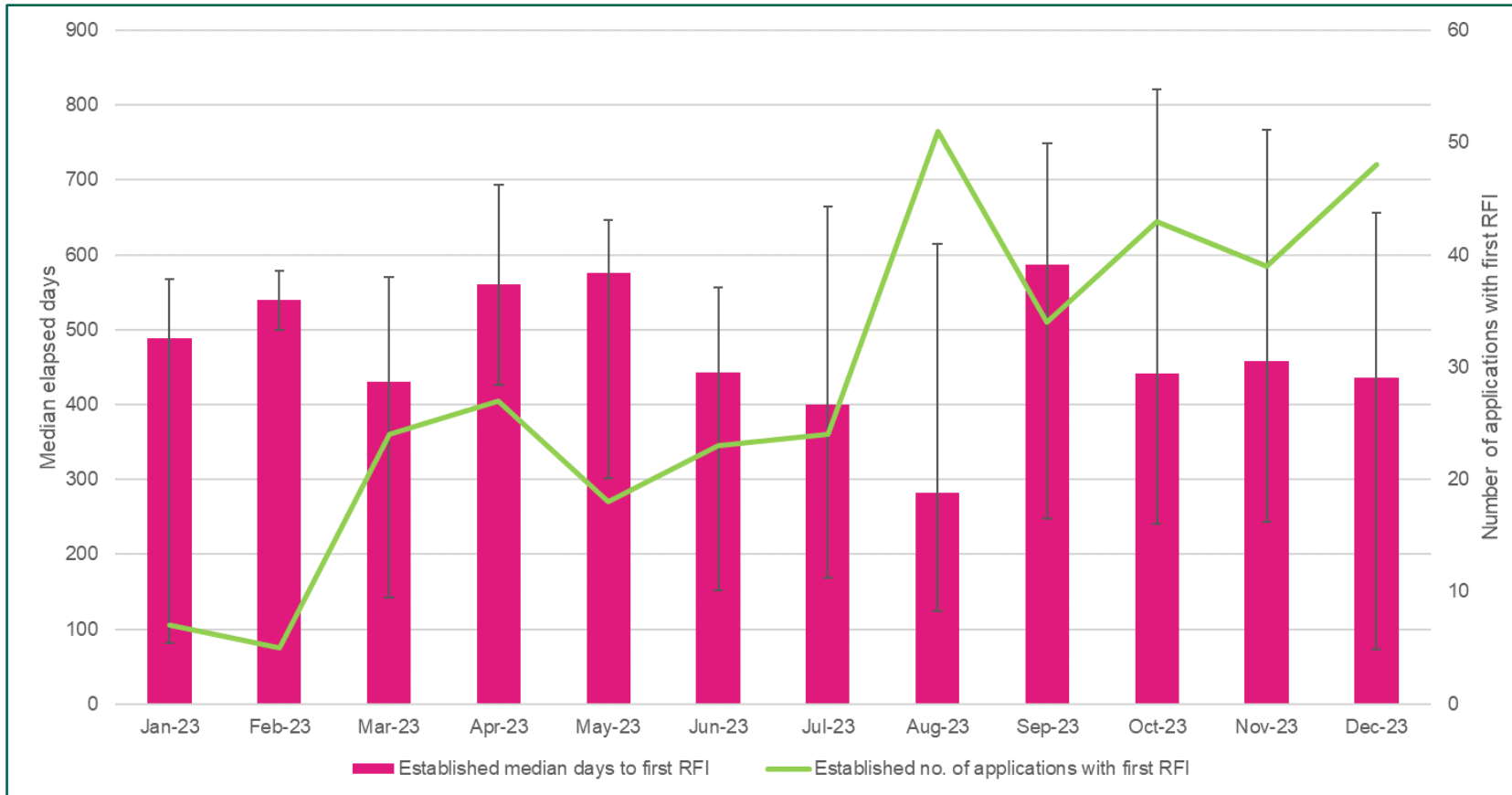
Figure 2. Initial national established licences - median time to first RFI (total elapsed days from received) & number of applications with first RFI for Jan - Dec 2023