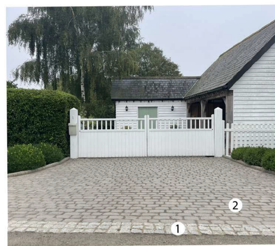
No. 2 Maggotts Cottage