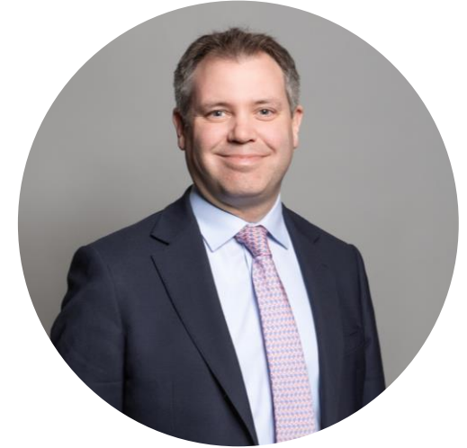
Edward Argar MP Minister of State for Prisons and Probation

I hope you find this information document useful.