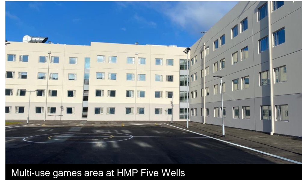
Multi-use games area at HMP Five Wells

Full technical details of the layout of the prison will be submitted as part of the reserved matters application and will be available to view online via the local authority planning portal.