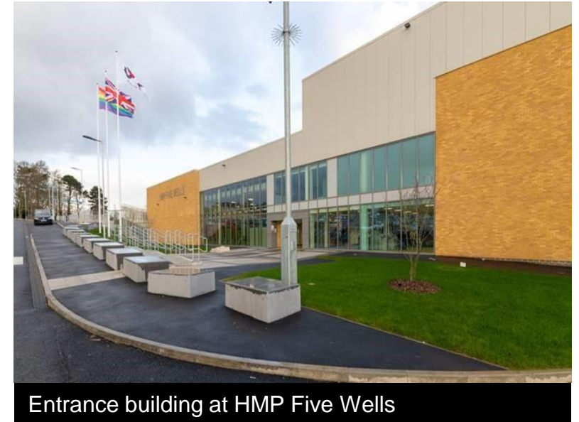
Entrance building at HMP Five Wells

Full technical details of the appearance of the prison will be submitted as part of the reserved matters application and will be available to view online via the local authority planning portal.