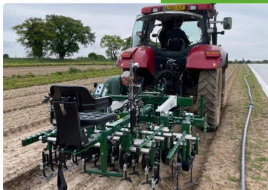
Camera guided hoe