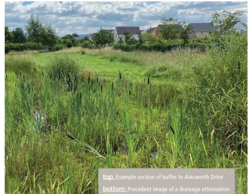
top: Example section of buffer to Ainsworth Drive