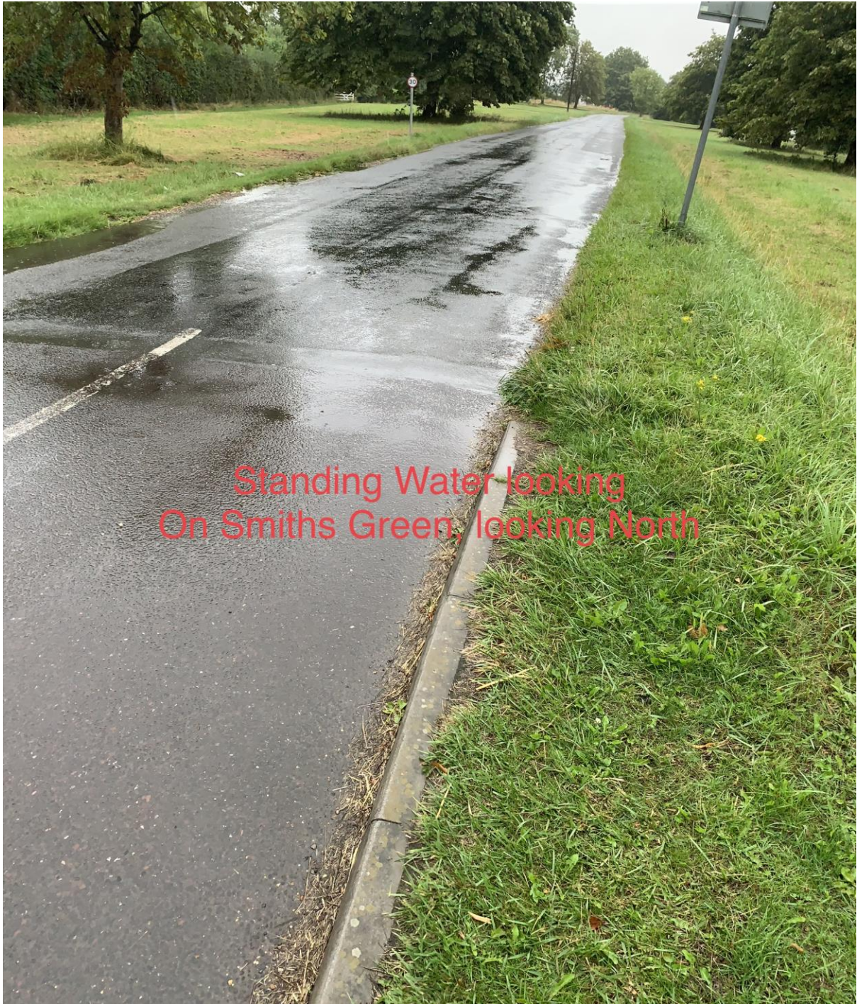
Standing Water looking On Smiths Green, looking North