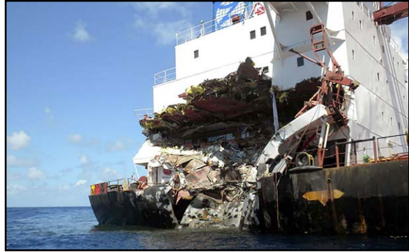
Seagate and Timor Stream