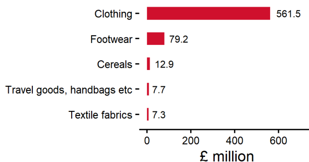
The top 5 UK goods imports, in the four quarters to the end of Q2 2023, from Cambodia