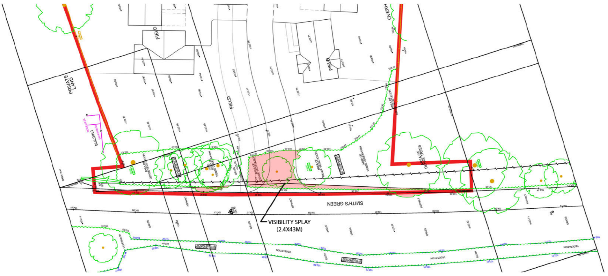
01 Proposed Entrance Plan

VEGETATION WITHIN THE VISIBILITY SPLAY TO BE CUT BACK