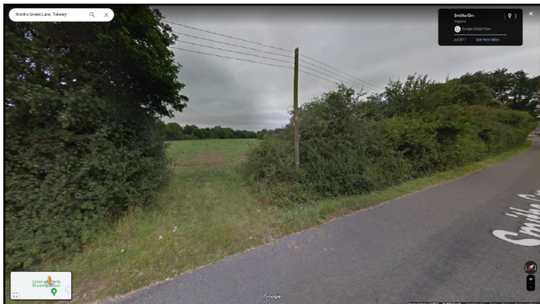
Figure 1. Existing Jack's Field access from Smiths Green Lane (Google Earth). The vegetation in question is to the right of the existing access.