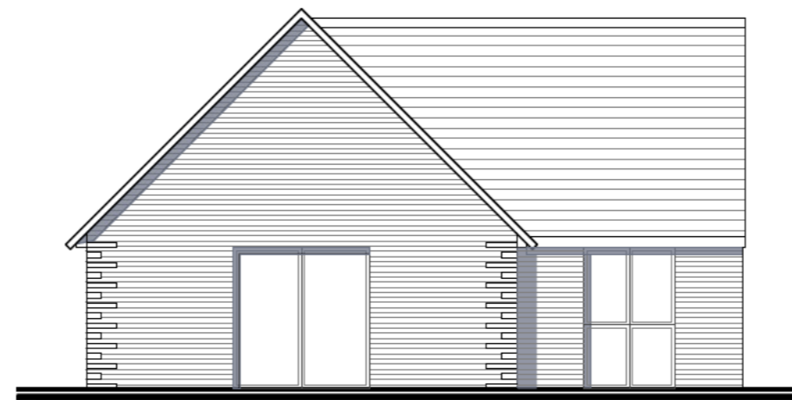
C Proposed Rear Elevation