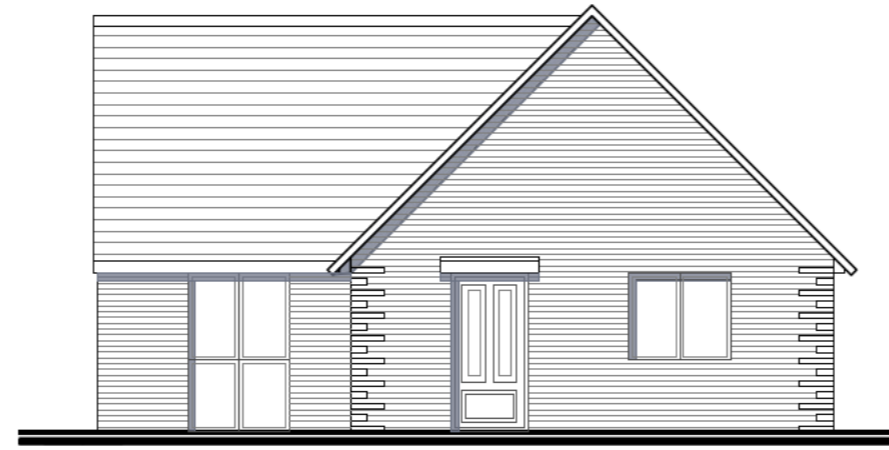
A Proposed Front Elevation