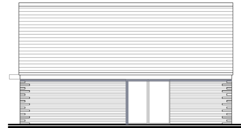
D Proposed Side Elevation