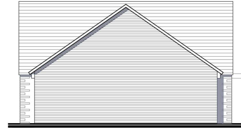
B Proposed Side Elevation