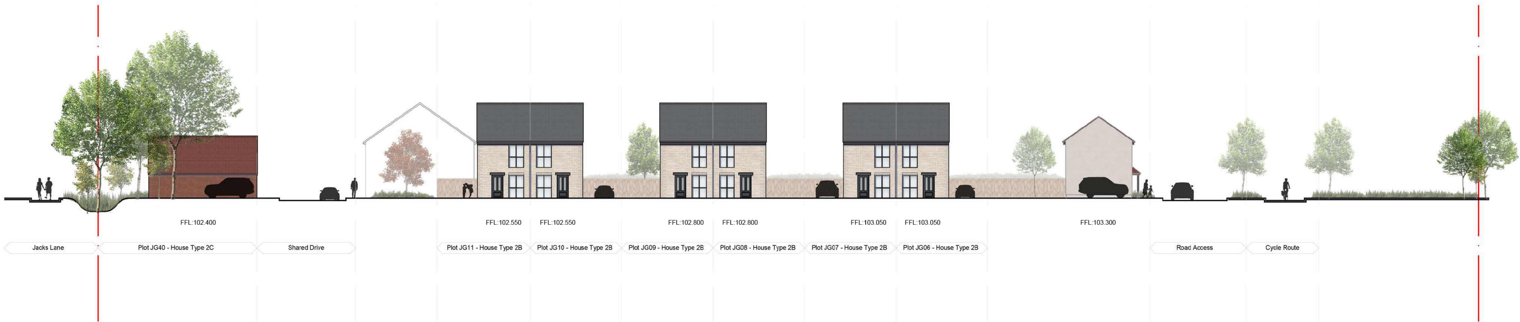
C Garden Village Street Scene C