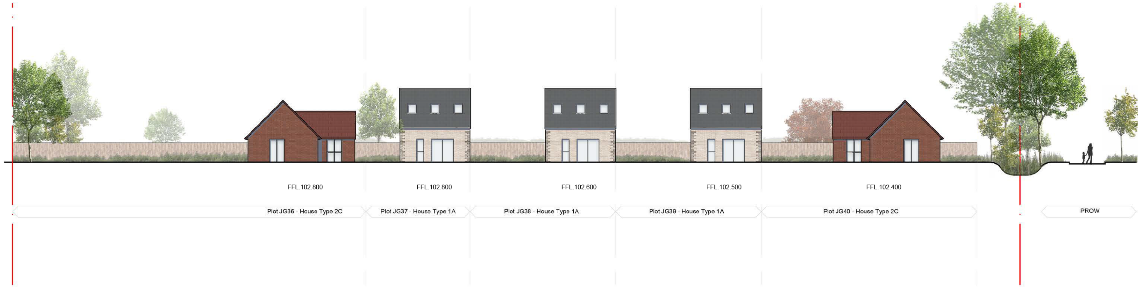
D Garden Village Street Scene D

Rev A - 26.01.23 - PMR Street scenes amended to suit Council comments Rev B - 19.09.23 - DJK Street scenes amended to suit Council comments Rev C - 26.10.23 - HM FFLs added