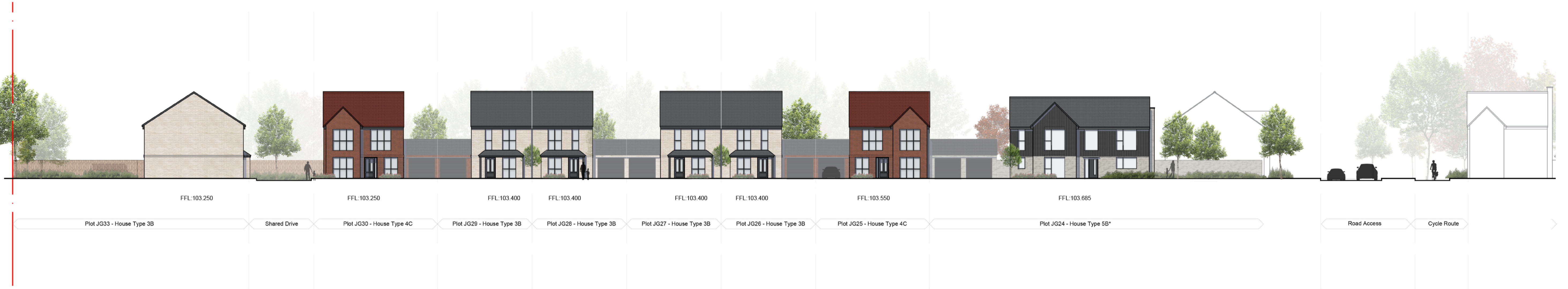
B Garden Village Street Scene B