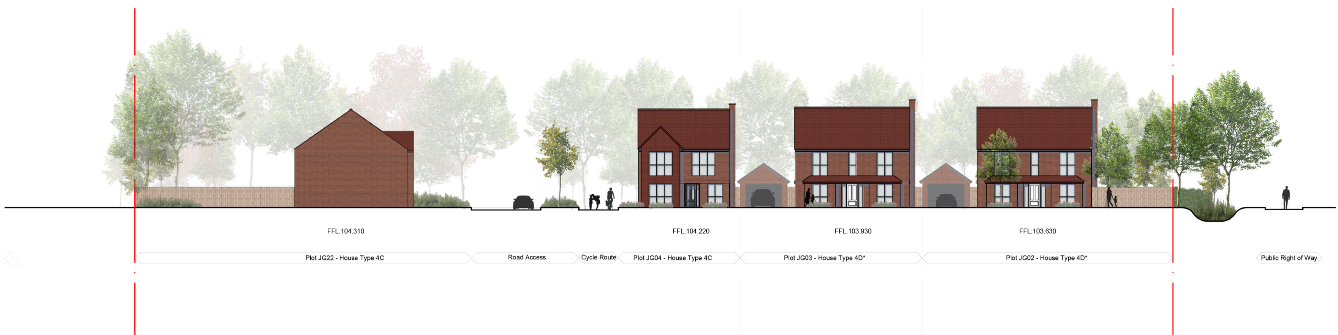
A Garden Village Street Scene A