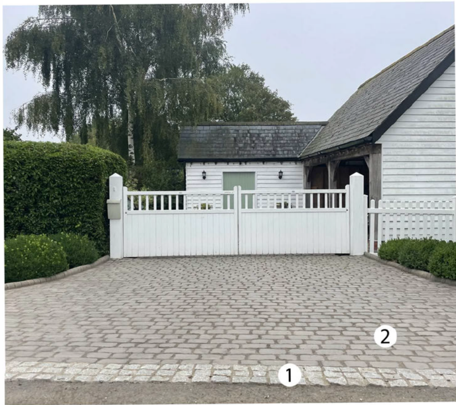
No. 2 Maggotts Cottage