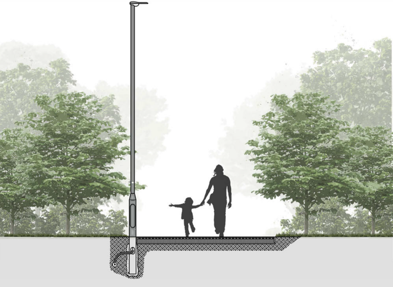
B Proposed Byway Section