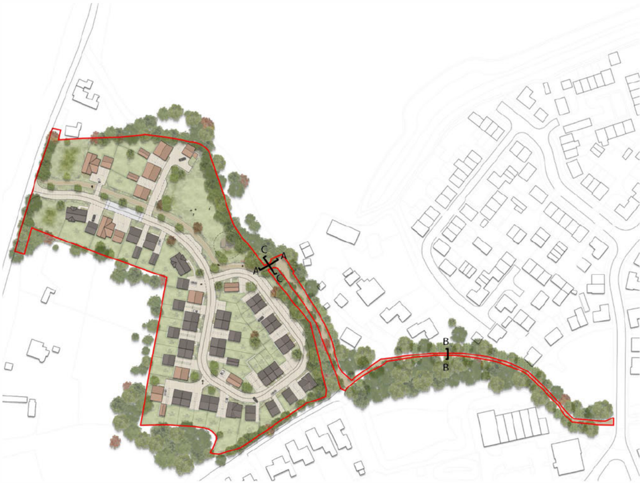
0 Proposed Site Plan @1:2500