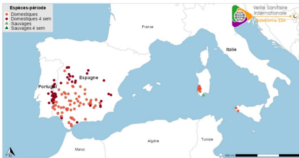
Figure 1: Map showing Epizootic Haemorrhagic Disease outbreaks in Europe reported on ADIS from November 2022 to 3 September 2023.

Since our previous report on Epizootic Haemorrhagic Disease (EHD) in Europe on 24 November 2022 there have been an additional 156 new outbreaks in Europe. Our previous report documented for the first time, EHD outbreaks in Spain, as well as a further 3 outbreaks in Italy. Since then, ADIS has reported an additional 11 outbreaks in Italy and 85 in Spain. Furthermore, in July 2023 EHD was reported for the first time in Portugal, and as of the 5 September, there have been 42 outbreaks in total (ADIS., 2023). Additionally, the Spanish Ministry of Agriculture, Fisheries and Food have reported a further 18 outbreaks in Spain as of 6 September 2023, these are not yet accounted for by ADIS data, bringing the total outbreaks of EHD in Spain to 103.