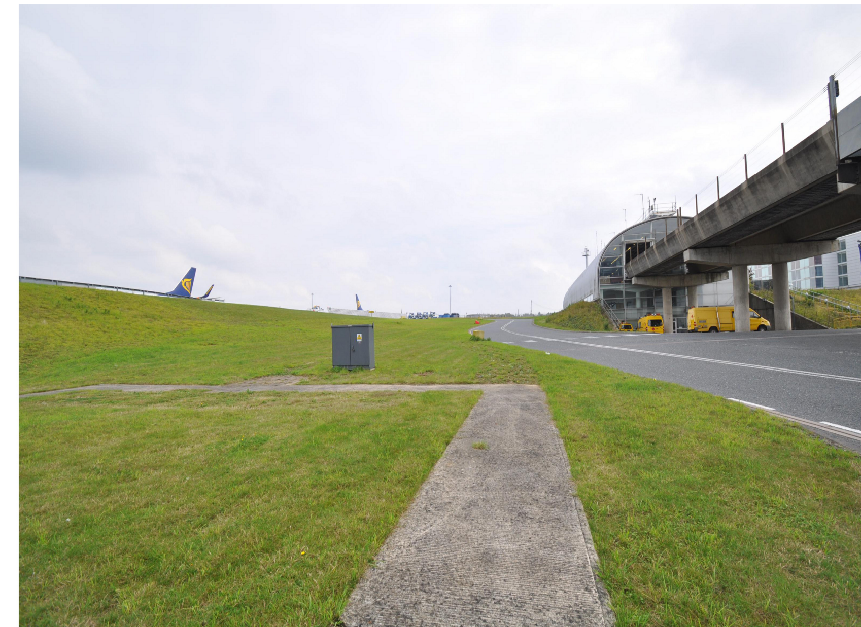
2 - VIEW OF TTS MAINTENANCE AND PROPOSED SITE OF PLANT ENCLOSURE