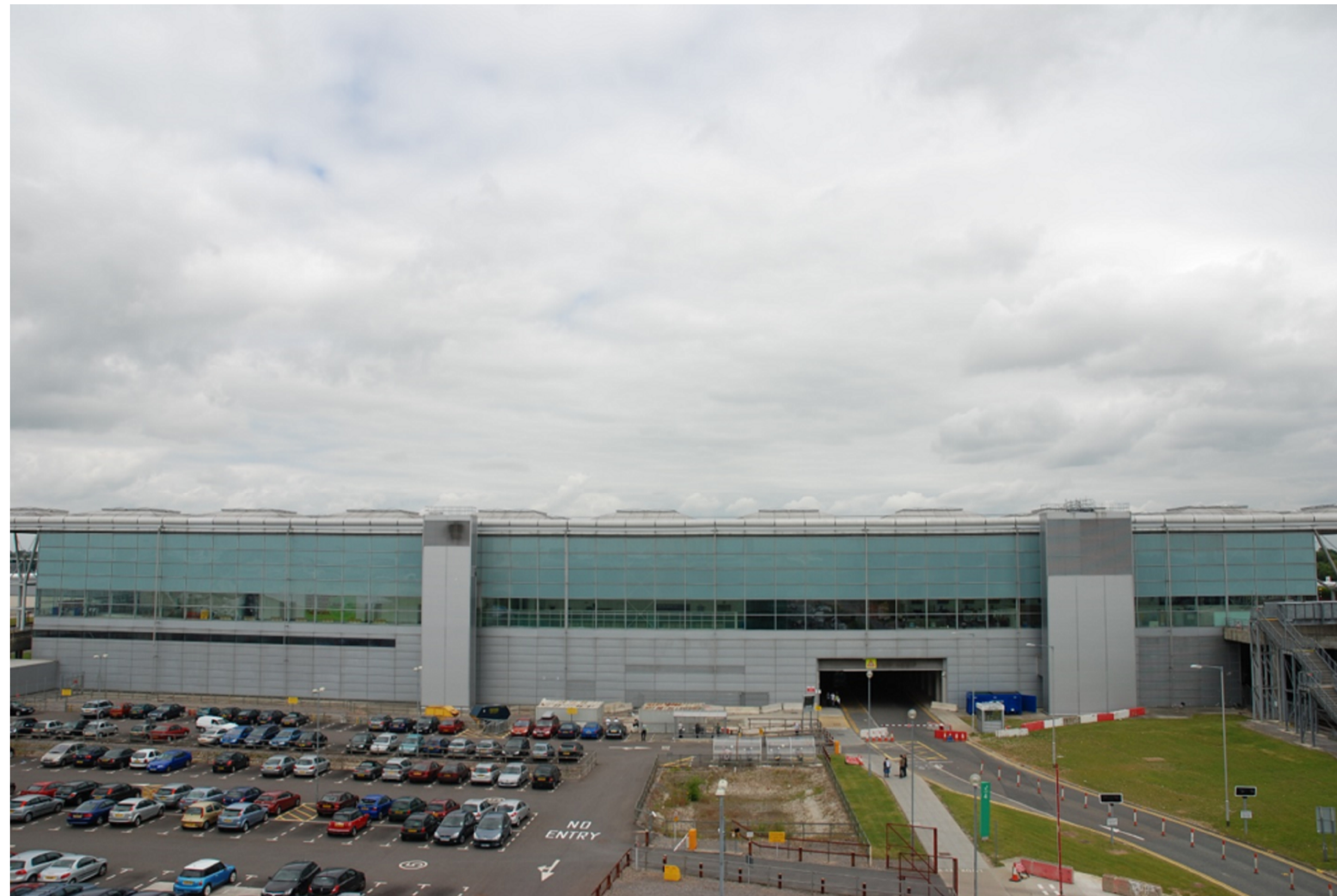
1 - VIEW OF WESTERN FACADE OF TERMINAL