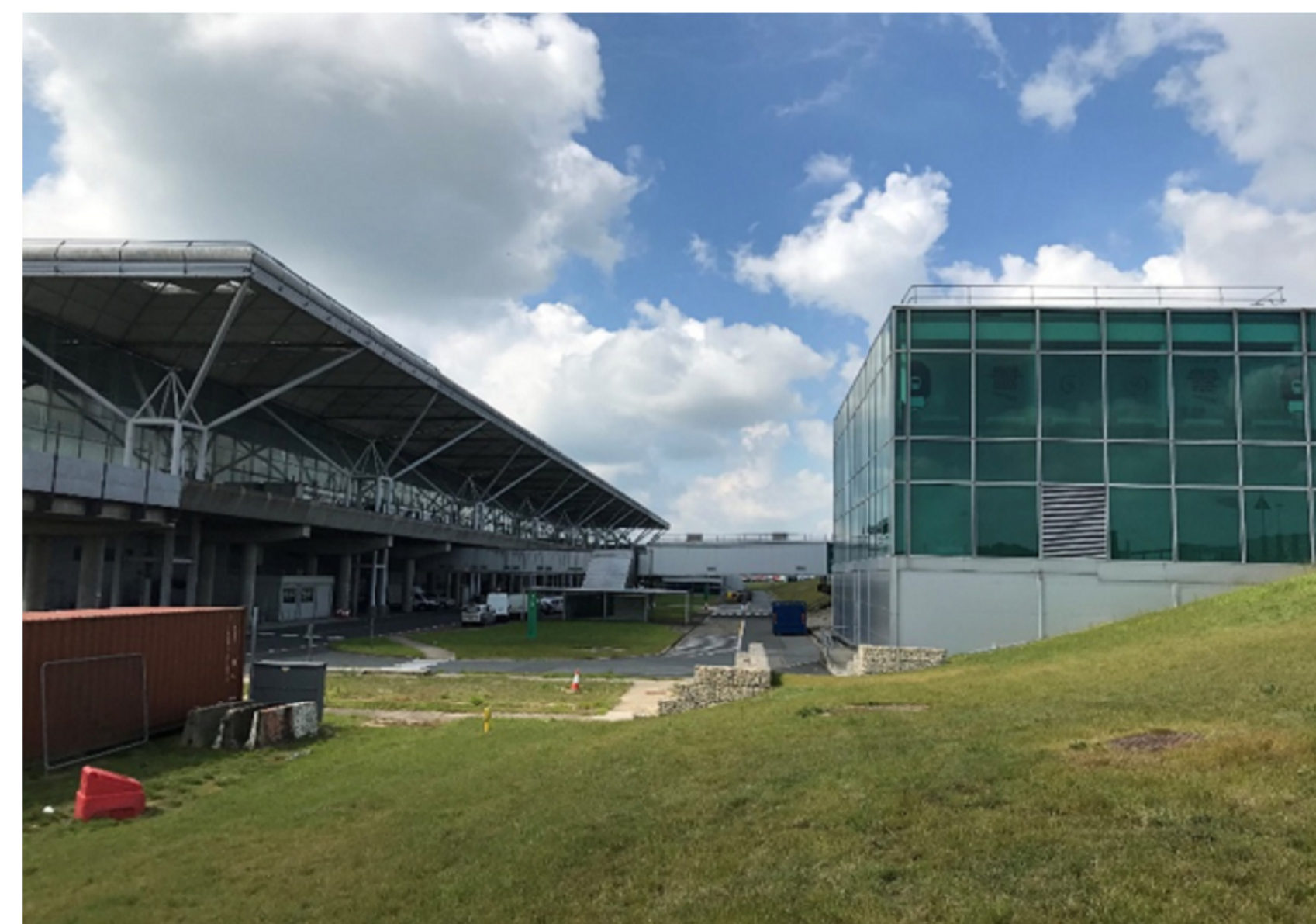
4 - VIEW OF TERMINAL AND SAT 3 CONNECTION