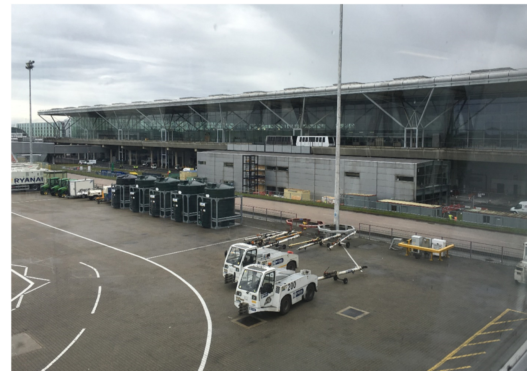
3 - VIEW OF TERMINAL FROM APRON 1 AND BUS-GATE BUILDING