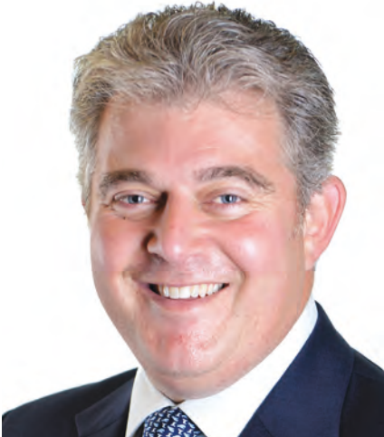
Rt Hon Brandon Lewis MP Minister of State for Policing and the Fire Service

The UK has a proud history as well as a strong track record of innovation. In recent years we have significantly reduced the number of people who die or are injured in fires, and this is a record of which we are very proud. We have also faced some significant environmental challenges, including flooding, major transport accidents, as well as major fires. Our focus on improving resilience and ensuring safety is designed into both our heritage as well as innovative buildings at the earliest stage and has directly contributed to our success.