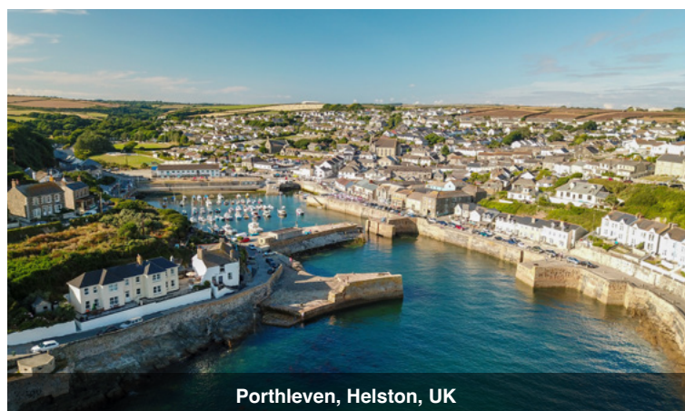
Porthleven, Helston, UK