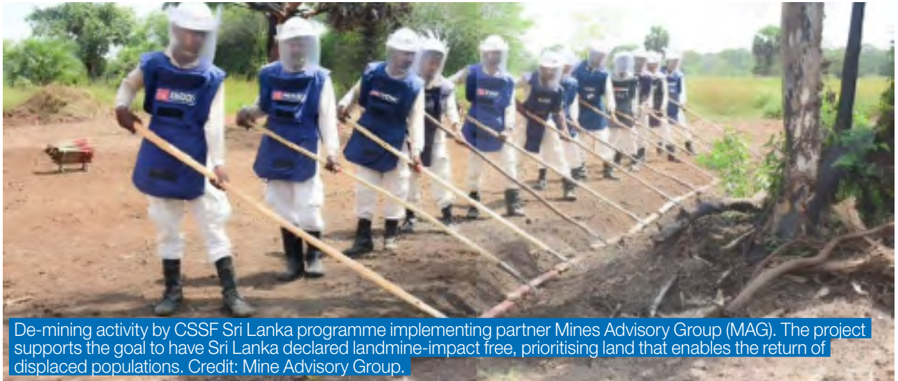
De-mining activity by CSSF Sri Lanka programme implementing partner Mines Advisory Group (MAG). The project supports the goal to have Sri Lanka declared landmine-impact free, prioritising land that enables the return of displaced populations.

The Bangsamoro peace process offers the promise of ending a decades-long conflict in the southern Philippines. The CSSF Philippines programme provides support to the Bangsamoro Autonomous Region of Muslim Mindanao (BARMM), ensuring the Bangsamoro Transitional Authority (BTA) is able to govern effectively and that women and girls are involved in post conflict reconstruction. As part of this the programme contributes to the Bangsamoro Normalisation Trust Fund, a mechanism that rehabilitates former rebels, provides technical assistance and mentoring to the new parliament, and improves women's participation in the political process. This wide-ranging package of support to the region ensures the UK has significant influence with key BTA members, allowing us to help shape the new parliament and law codes, and cementing the UK's reputation as a reliable partner for peace in the Philippines.