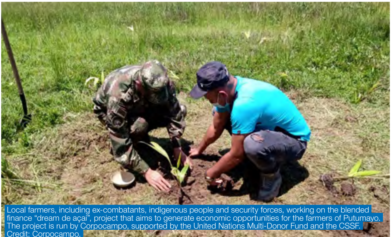
Local farmers, including ex-combatants, indigenous people and security forces, working on the blended finance “dream de açai”, project that aims to generate economic opportunities for the farmers of Putumayo. The project is run by Corpocampo, supported by the United Nations Multi-Donor Fund and the CSSF.

America, Ecuadorian customs lacked the support and resourcing to combat narcotics smuggling. With CSSF funding, the Home Office began to support Ecuador through the provision of training and equipment. In collaboration with the US, the Anti-Narcotics Police of Ecuador established a dedicated Analysis and Targeting Centre. The United States' International Narcotics and Law Enforcement Unit (INL) funded the renovation of a dedicated building in Guayaquil in order to develop it into the Analysis Centre, and asked the UK to partner with them to provide software, technology and equipment to deliver the project. As a result in the first quarter of 2022-2023 the centre was responsible for the detection and seizure of 29 tonnes of cocaine, compared to just 8 tonnes seized in the whole of the previous financial year. The centre has been directly responsible for the seizure of cocaine worth an estimated £2 billion since it became operational. This support has extended to ports, where the software supplied by the UK vastly accelerates the process of investigating ships and identifying containers that are more likely to yield seizures, which in turn makes corruption harder.