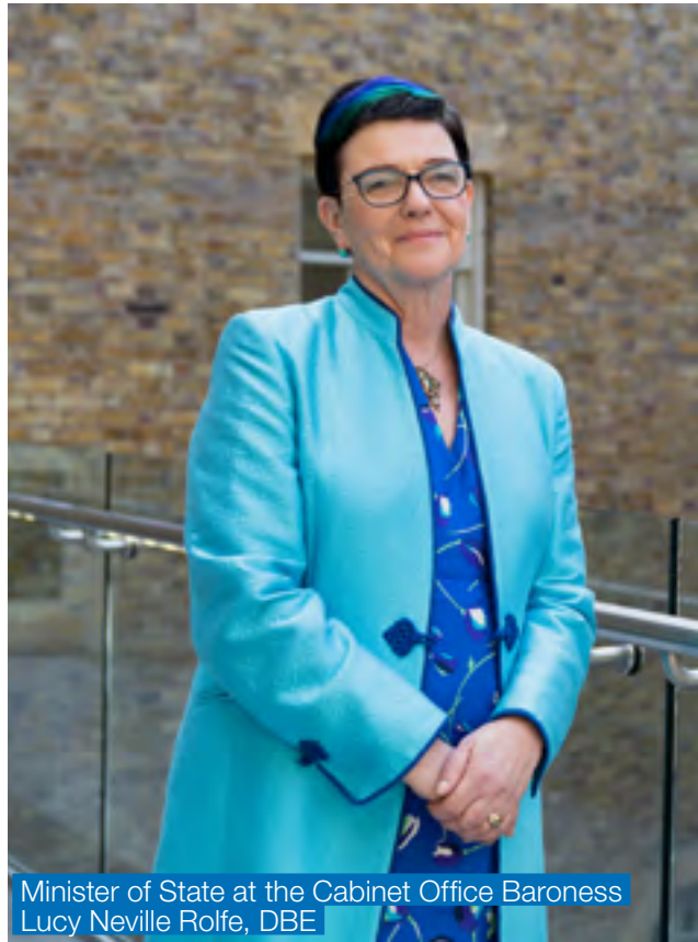
Minister of State at the Cabinet Office Baroness Lucy Neville Rolfe, DBE

As the financial year drew to a close, intensifying Russian aggression culminated in its invasion of Ukraine in February 2022. Through the CSSF, HMG has been working in Ukraine since 2016 as a key partner of the Ukrainian government, helping Ukraine's self-defence against Russian threats and providing British-led training to the Ukrainian military. In response to the growing build-up of Russian military on Ukraine's border, the Fund had already been adapted to enable provision of support on energy security, local government crisis response and strategic communications capacity in the Ukrainian Ministry of Foreign Affairs. Immediately following the invasion, CSSF funding rapidly pivoted to commit £32m for Ukraine, while other parts of HMG prepared larger packages of military support. This funding included a £20m contribution to the Government of Ukraine for the armed forces and £4.4m for essential body armour and trauma packs for military and civil security personnel on the front line.