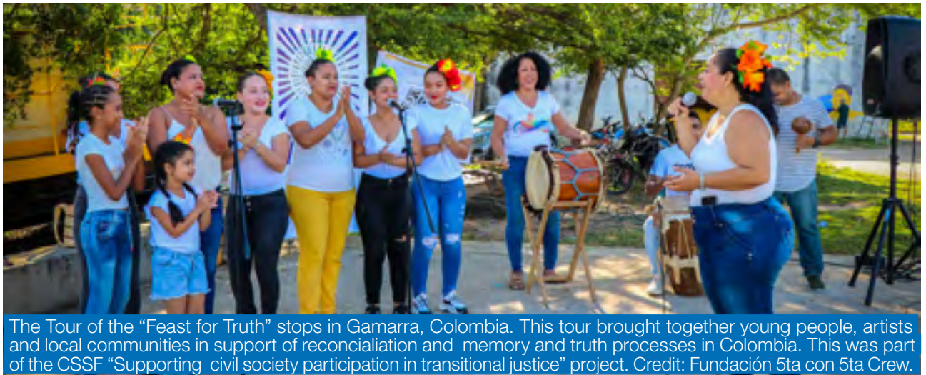
The Tour of the “Feast for Truth” stops in Gamarra, Colombia. This tour brought together young people, artists and local communities in support of reconciliation and memory and truth processes in Colombia. This was part of the CSSF “Supporting civil society participation in transitional justice” project.