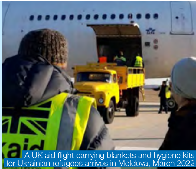
A UK aid flight carrying blankets and hygiene kits for Ukrainian refugees arrives in Moldova, March 2022