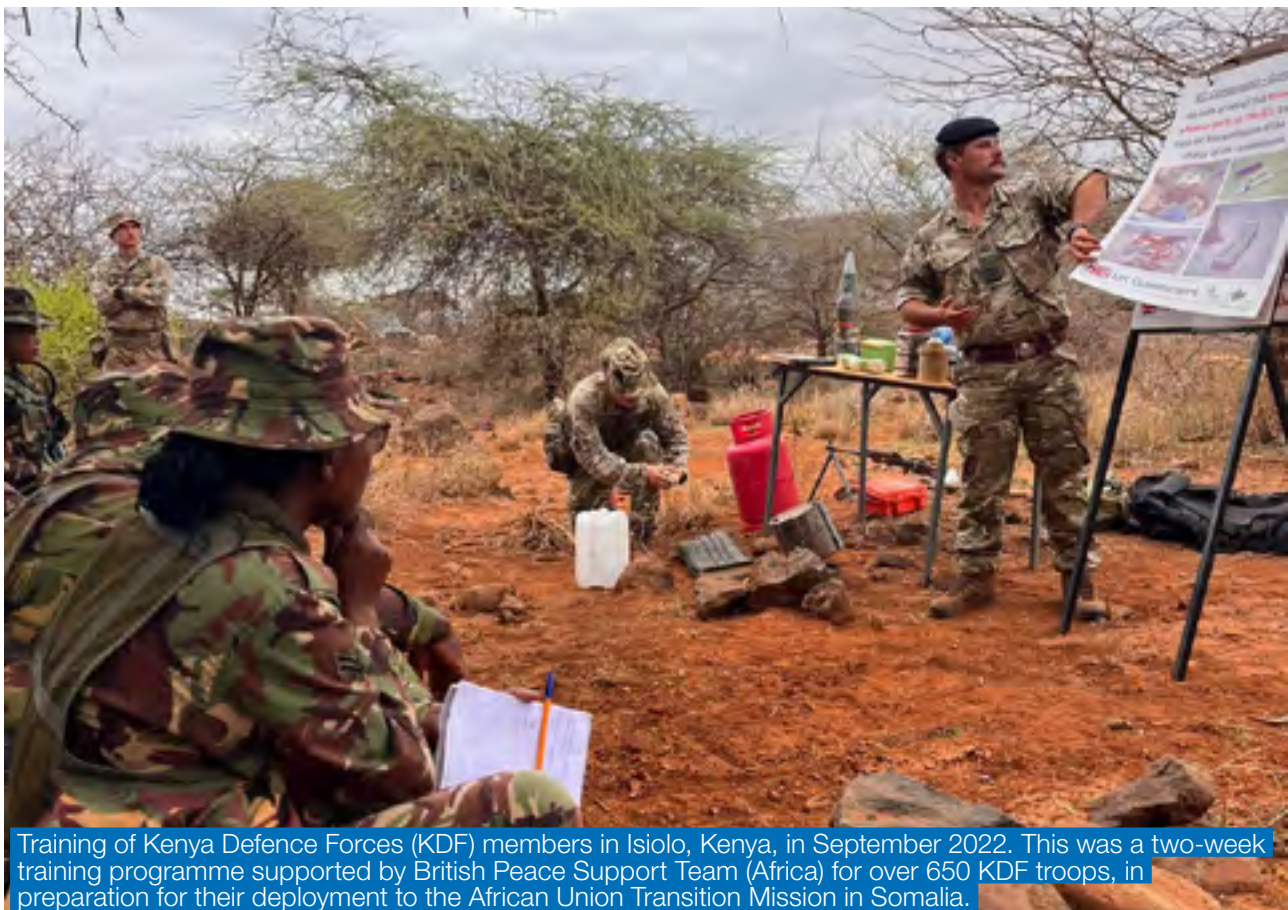
Training of Kenya Defence Forces (KDF) members in Isiolo, Kenya, in September 2022. This was a two-week training programme supported by British Peace Support Team (Africa) for over 650 KDF troops, in preparation for their deployment to the African Union Transition Mission in Somalia.

In Ukraine, since the Russian invasion in February 2022, the CSSF has supported the United Nations Population Fund (UNFPA) to counter gender-based violence. This programme has delivered emergency reproductive health hygiene and dignity kits for conflict-affected women and girls, displaced women with children, and pregnant women. Almost 15 tonnes of supplies were delivered to hospitals in Kyiv, Kharkiv, Dnipro and Zaporizhzhia—cities and regions that receive survivors of sexual violence via 'green corridors'. Separately, UNFPA, together with La Strada hotline, developed guidelines on how to document conflict-related sexual violence cases and provide support. At the same time all hotline operators completed refresher training on providing counselling to survivors of sexual violence.