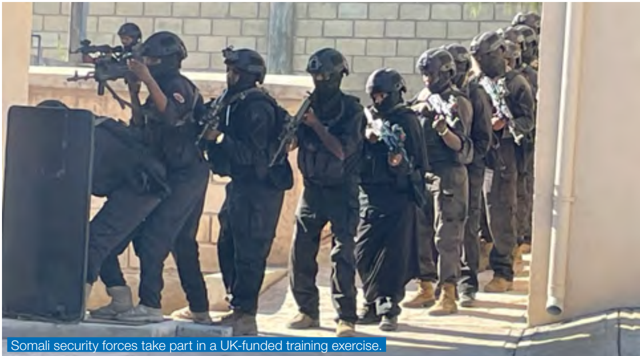
Somali security forces take part in a UK-funded training exercise.

Transnational environmental crime generates an estimated $110 to $281 billion annually 3 , much of which also funds SOC and terrorism. The CSSF has delivered an environmental crime toolkit to aid institutions to root out this illegal activity. The toolkit is designed to help identify illicit financial transactions related to the Illegal Wildlife Trade (IWT) and shine a spotlight on high level corrupt individuals in line with UK Global Sanctions. The toolkit was launched by the Duke of Cambridge at the Dubai Expo and presented to a law enforcement subgroup of the G7, receiving unanimous support. After global launches in UAE and Kenya in March 2022, the toolkit was endorsed by financial institutions in Africa and Asia. Intensive engagement with Japanese authorities on the toolkit increased Japan's focus on the transnational environmental crime issues significantly during their G7 Presidency.