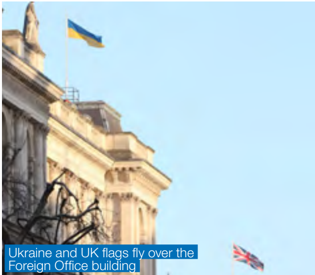
Ukraine and UK flags fly over the Foreign Office building