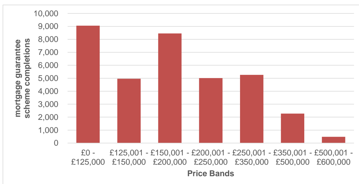
Chart 1: Completions by property value from 19 April 2021 to 31 December 2022