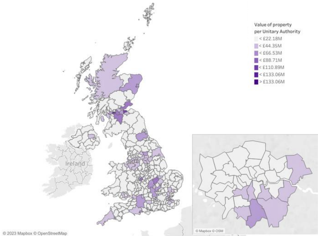
Map 1: Location and value of completed mortgages supported by the 2021 mortgage guarantee scheme from 19 April 2021 to 31 December 2022, by local authority, UK