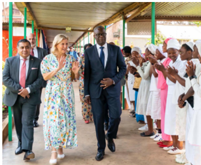
Lord (Tariq) Ahmad of Wimbledon Minister of State and Prime Minister's Special Representative for Preventing Sexual Violence in Conflict, Her Royal Highness the Duchess of Edinburgh, and Nobel Peace Prize laureate Dr Denis Mukwege meet staff at the Panzi Hospital in Bukavu DRC, which specialises in treating survivors of gender-based violence

In October 2022, Lord (Tariq) Ahmad of Wimbledon Minister of State and Prime Minister's Special Representative for Preventing Sexual Violence in Conflict, accompanied Her Royal Highness the Duchess of Edinburgh on a visit to the Democratic Republic of the Congo (DRC) and met with President Tshisekedi, and Foreign Minister Lutundula to discuss GBV, stressing the importance of tackling CRSV and the central role of survivors. Following the UK's close engagement, the Government of DRC endorsed the Call to Action to Ensure the Rights and Wellbeing of Children Born of Sexual Violence in Conflict 1 and has committed to implement the Platform for Action 2 . The Government also endorsed the PSVI Political Declaration and made a strong national commitment.