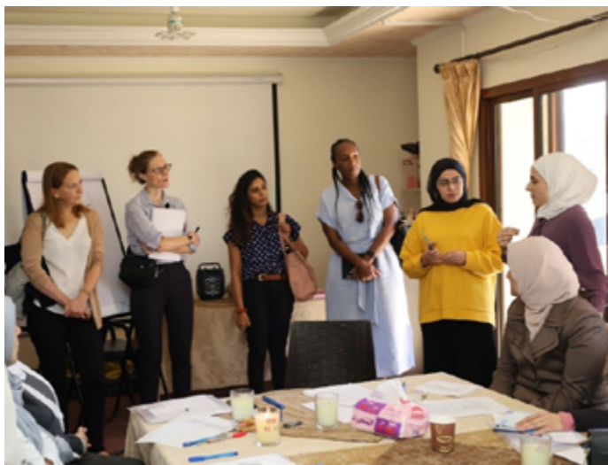
FCDO regional gender advisor visits a women's centre in Bekaa supported by Women Now for Development, a women-led organisation (WLO) supported by the Women's International League for Peace and Freedom, Lebanon

In Myanmar , the UK focused on building the capacity of women leaders to engage in policy consultations, dialogue and peacebuilding, through the UK's support to the Joint Peace Fund, and elevating the role of women in the humanitarian response. As part of the UK's