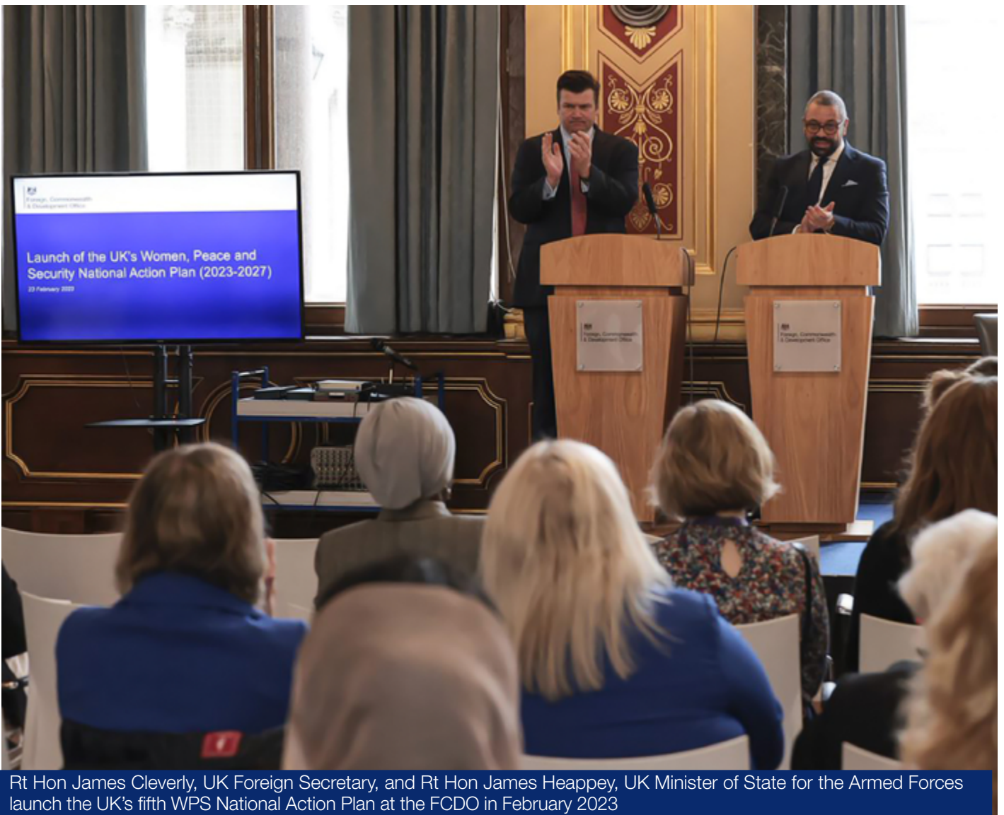
Rt Hon James Cleverly, UK Foreign Secretary, and Rt Hon James Heappey, UK Minister of State for the Armed Forces launch the UK's fifth WPS National Action Plan at the FCDO in February 2023

We would like to extend our thanks to the APPG, civil society organisations and all women activists across the globe, who have been instrumental in supporting the implementation of the UK's WPS NAP 2018-2022.