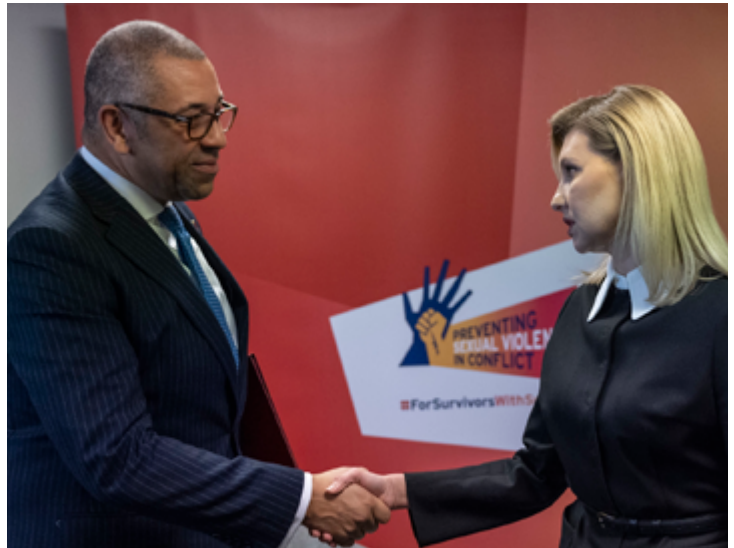
Rt Hon James Cleverly, UK Foreign Secretary, meets Ukrainian First Lady Olena Zelenska at the 2022 Preventing Sexual Violence in Conflict Initiative (PSVI) Conference in London

The UK led the international community's pushback against attempts to roll back women's rights across the globe. The UK is proud of its reputation as a global leader on WPS and we take seriously our role as WPS penholder on the UN Security Council (UNSC). The UK's adversaries continue to weaponise gender inequality on the multilateral stage to disrupt the rules-based international system. We continue to use our standing in the UN to champion the inclusion of WPS in UNSC resolutions. For example, in March 2022 we secured strong language on women and girls in UNSC Resolution 2626 (2022) regarding the mandate of the UN Assistance Mission in Afghanistan, by coordinating with likeminded Council members, alongside then-penholder Norway, despite attempts from obstructionist Council members to remove the language.