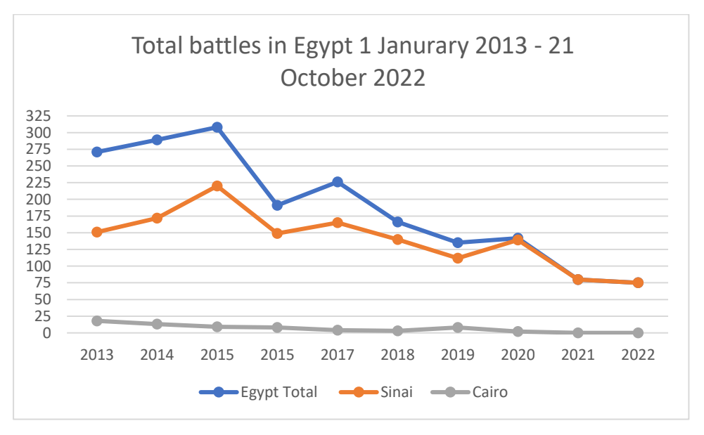
Back to Contents

6.2.8 Graph below shows number of battles in Egypt and Sinai based on data from ACLED dashboard. 102