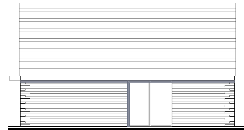
D Proposed Side Elevation