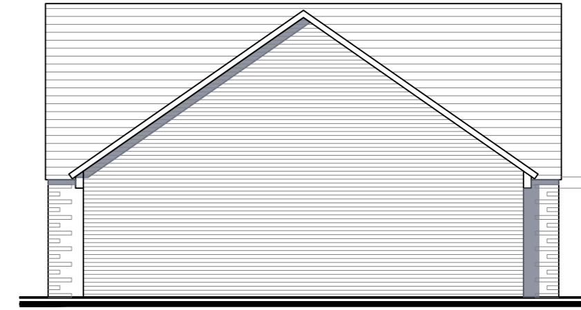
B Proposed Side Elevation