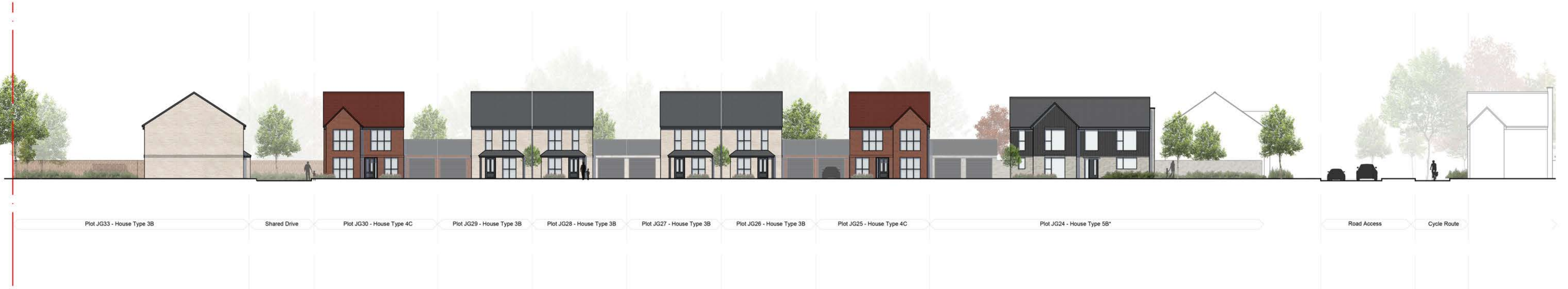
B Garden Village Street Scene B

Rev A - 26.01.23 - PMR Street scenes amended to suit Council comments