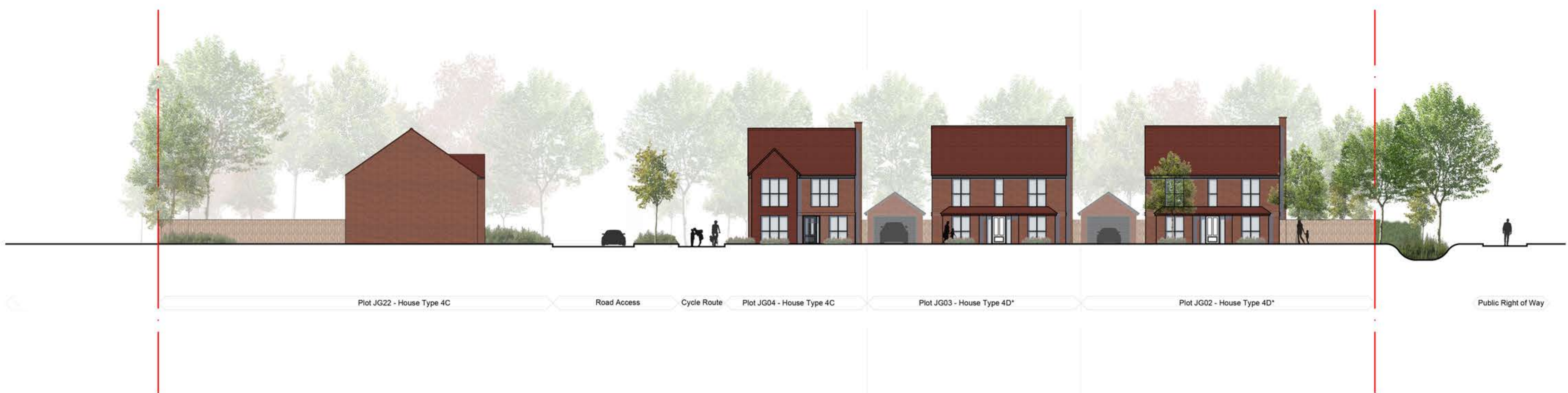
A Garden Village Street Scene A