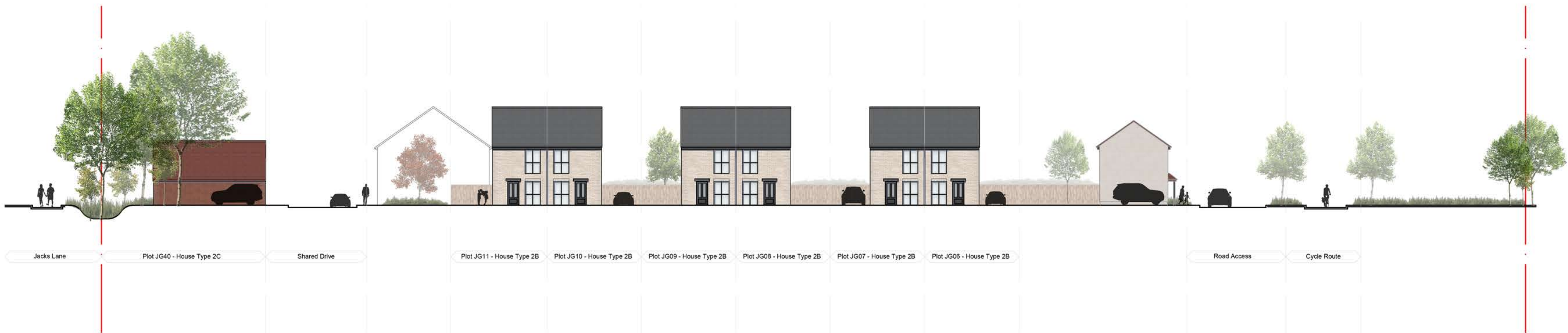
C Garden Village Street Scene C