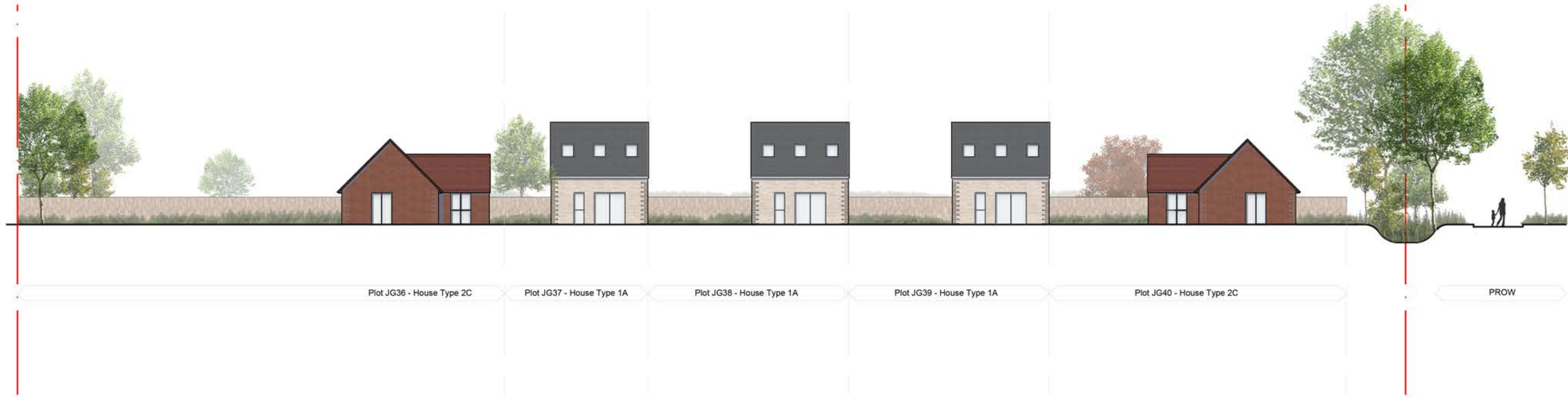
D Garden Village Street Scene D

Rev A - 26.01.23 - PMR Street scenes amended to suit Council comments