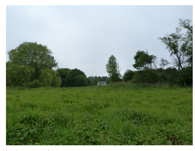
North-east corner of site