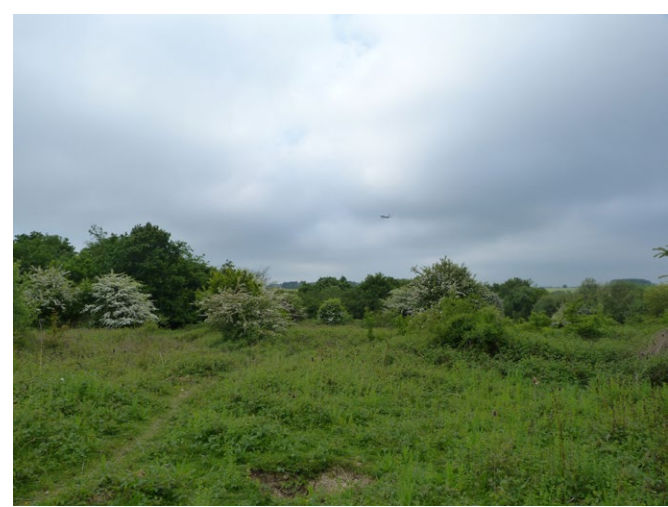
View south across site