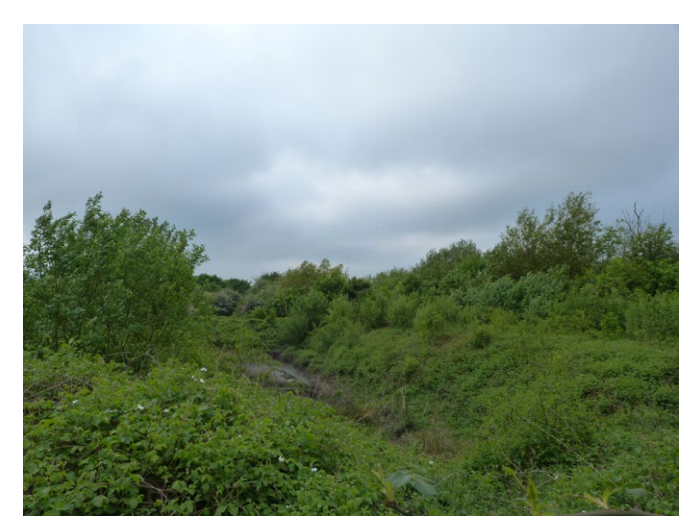
North-west corner of site

Between the 1983 OS map and the present day the buildings within the site have been demolished, leaving the site as open land with wooded areas. It now lies to the south-east of the major MII/ Stansted Airport junction, in an area populated by light industry and warehouses.