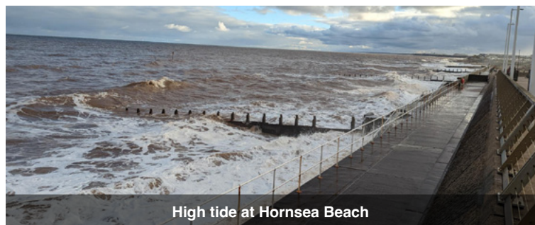
High tide at Hornsea Beach

During these visits, we heard from several fishers that they would like to know more about the NEIFCA pot limits byelaw and so NEIFCA were invited to speak at the RFG meeting which was held on the 17 January. We heard views on berried lobster and how this may impact future management measures which we've fed back to the Crab and Lobster Fisheries Management Plan (FMP) team and have had conversations with Defra on. Thank you to everyone who took the time to speak to us, and we're looking forward to coming back in the future.