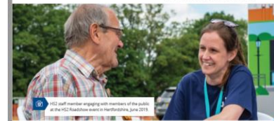
HS2 Ltd Community Engagement Strategy