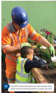
HS2 Ltd Community Engagement Strategy