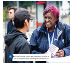
HS2 staff member meeting with members of the public at the HS2 Roadshow event in Birmingham, September 2021