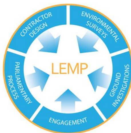
Figure 1: Key work streams that will provide additional information for the LEMPs.