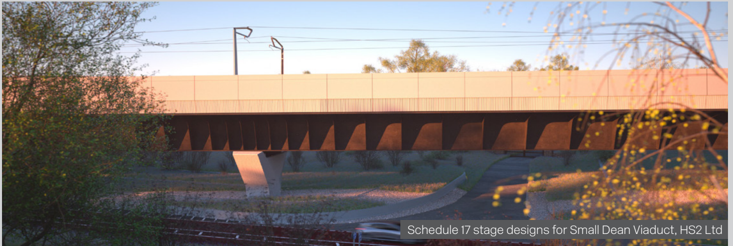
Schedule 17 stage designs for Small Dean Viaduct, HS2 Ltd