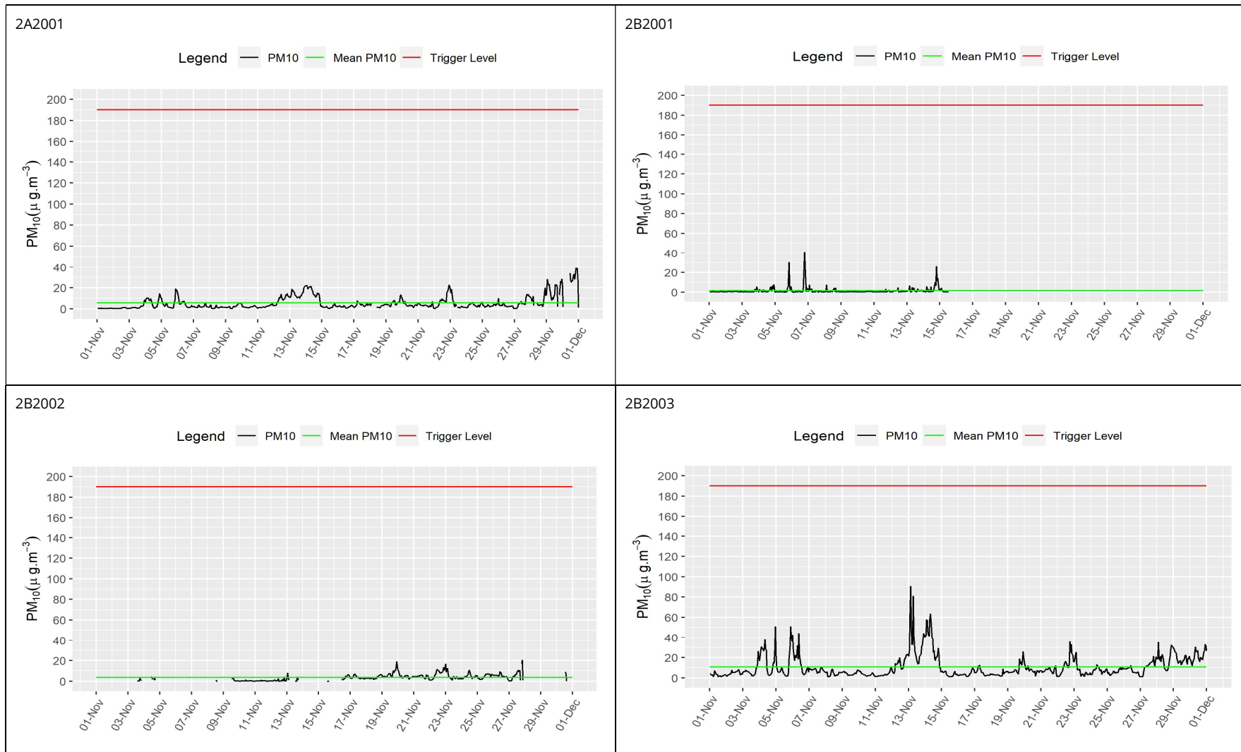
Figure 4: Construction dust 1-hour mean indicative PM 10 concentration for all dust monitors