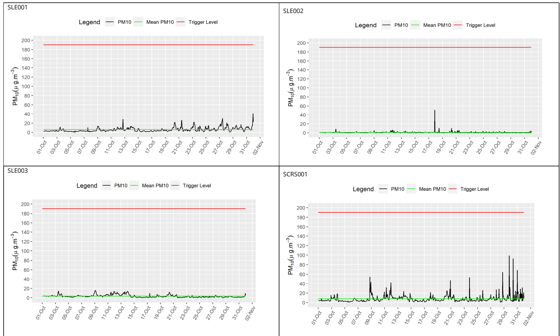
Figure 2: Construction dust 1-hour mean indicative PM 10 concentration for all dust monitors