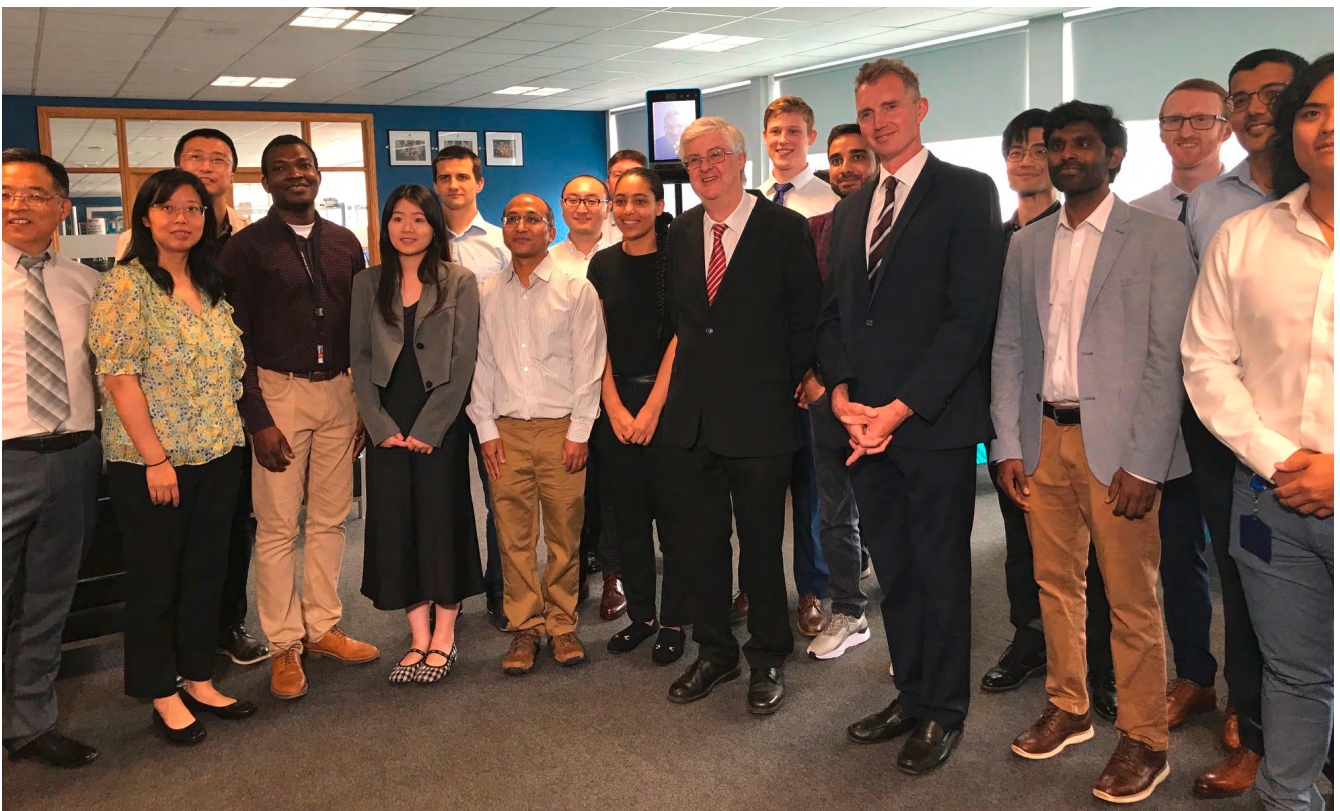
First Minister of Wales Right Honourable Mark Drakeford MS and the then UK Government Parliamentary Under-Secretary of State for Wales Right Honourable David TC Davies MP attend Bangor University's Digital Signal Processing Centre of Excellence in July. This is one of the projects receiving funding from the North Wales Growth Deal.

In September, the then Secretary of State for Education, the Right Honourable Kit Malthouse MP, spoke to the Scottish Cabinet Secretary for Education and Skills, Shirley-Anne Somerville MSP, the Minister for Education and Welsh Language, Jeremy Miles MS, and Michelle McIlveen MLA and Gordon Lyons MLA, the former Minister for Education and former Minister for the Economy respectively in the Northern Ireland Executive. The calls covered wide-ranging and important issues such as exams, higher education reforms and cost of living implication on education and children's services, including the support provided through the Energy Price Guarantee. There was agreement amongst all ministers to work together in the future on other shared priorities.