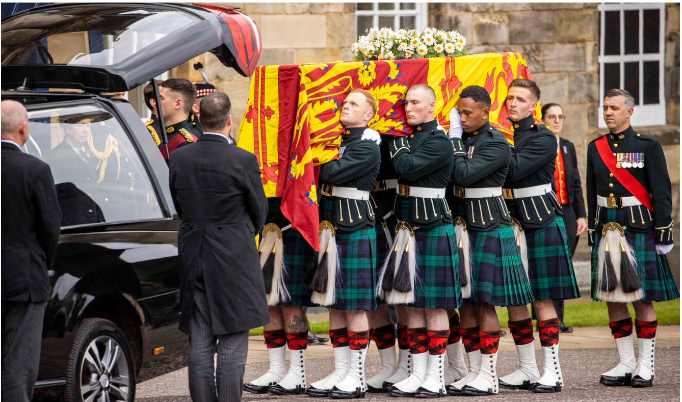
Pallbearers carry the coffin of Her Majesty Queen Elizabeth II, draped with the Royal Standard of Scotland outside the Palace of Holyroodhouse in Edinburgh.

Operation LONDON BRIDGE and Operation SPRING TIDE are the names given to the planning and delivery of the ten-day series of events following the sad announcement of the passing of Her Majesty The Queen and the succession of King Charles III respectively. These were truly a national effort. Years of advance planning brought together the UK, Scottish and Welsh governments, the NI Executive Office and the Northern Ireland, Scotland and Wales Offices, as well as local authorities, to deliver one of the largest and most complex events the UK has ever held. At a time of immense national sadness, and with the attention of many around the world focussed on the UK, teams and operational command hubs were stood up in London, Windsor, Edinburgh, Belfast and Cardiff to support the delivery of Operation LONDON BRIDGE and Operation SPRING TIDE.