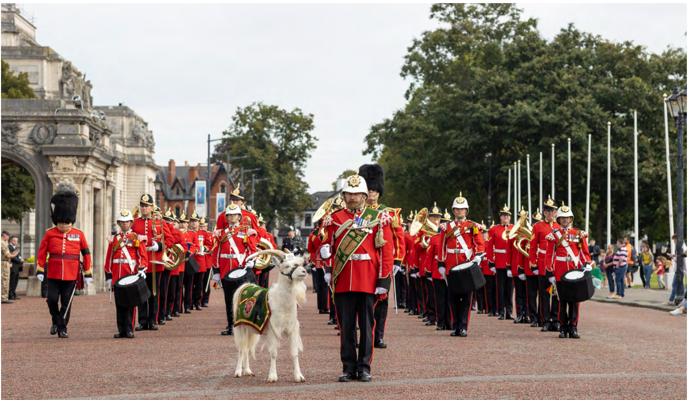
Personnel from 3rd Battalion The Royal Welsh, wearing ceremonial uniform and marching with their regimental goat.

In the years and months preceding the announcement of the death of Her Majesty the Queen, teams across the UK met and drew up plans to ensure the operation could be delivered safely and securely, and that it was a fitting tribute to Her Majesty's extraordinary life and legacy. Monthly National Steering Groups and Operations Groups, which included devolved governments' teams, considered readiness, risk and priority areas, looking at everything from floral tributes to public safety. A comprehensive programme of testing and exercising had been ongoing in key locations across the UK. During the delivery of the operation, daily ministerial calls were chaired by the then Chancellor of the Duchy of Lancaster, the Right Honourable Nadhim Zahawi MP. The UK Government and representatives from the devolved governments met several times per day via both civil servants and ministerial coordination calls.