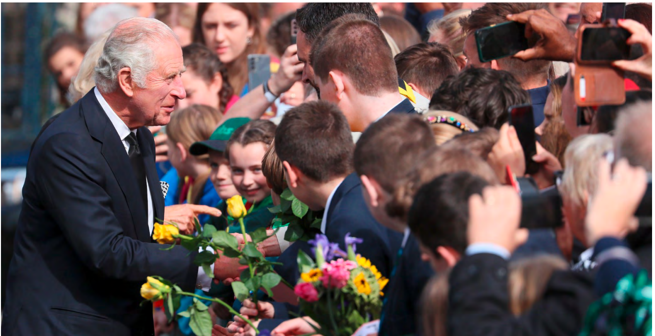
His Majesty The King and The Queen Consort greet crowds outside of Hillsborough Castle.

“Years of advance planning brought together the UK, Scottish and Welsh governments, the NI Executive Office and the Northern Ireland, Scotland and Wales Offices, as well as local authorities, to deliver one of the largest and most complex events the UK has ever held”.