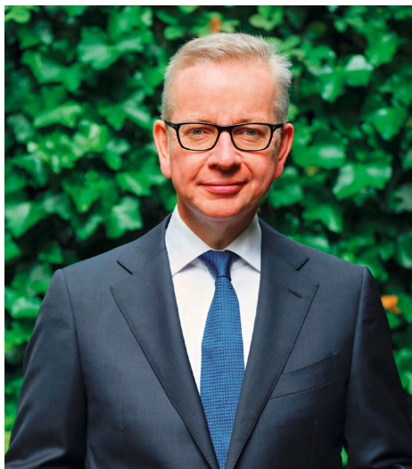
Right Honourable Michael Gove MP, Secretary of State for Levelling Up, Housing & Communities and Minister for Intergovernmental Relations

As we head into winter, we commit to working together to face the challenges that confront us at home and around the world.