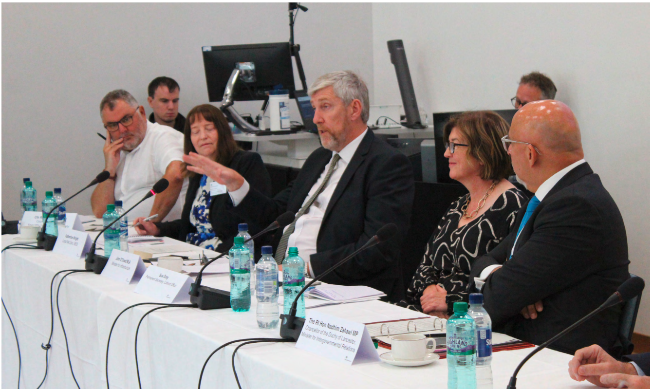
Former Northern Ireland Minister for Infrastructure John O'Dowd MLA, the Second Permanent Secretary to the Cabinet Office Sue Gray, and the then Chancellor of the Duchy of Lancaster Right Honourable Nadhim Zahawi MP talking at the Islands Forum in Orkney.