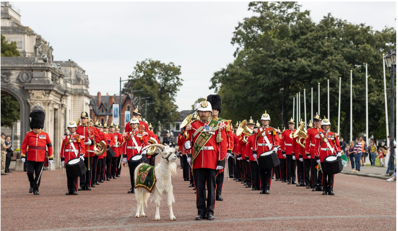
Personnel from 3rd Battalion The Royal Welsh, wearing ceremonial uniform and marching with their regimental goat.

In the years and months preceding the announcement of the death of Her Majesty the Queen, teams across the UK met and drew up plans to ensure the operation could be delivered safely and securely, and that it was a fitting tribute to Her Majesty's extraordinary life and legacy. Monthly National Steering Groups and Operations Groups, which included devolved governments' teams, considered readiness, risk and priority areas, looking at everything from floral tributes to public safety. A comprehensive programme of testing and exercising had been ongoing in key locations across the UK. During the delivery of the operation, daily ministerial calls were chaired by the then Chancellor of the Duchy of Lancaster, the Rt Hon Nadhim Zahawi MP. The UK Government and representatives from the devolved governments met several times per day via both civil servants and ministerial coordination calls.