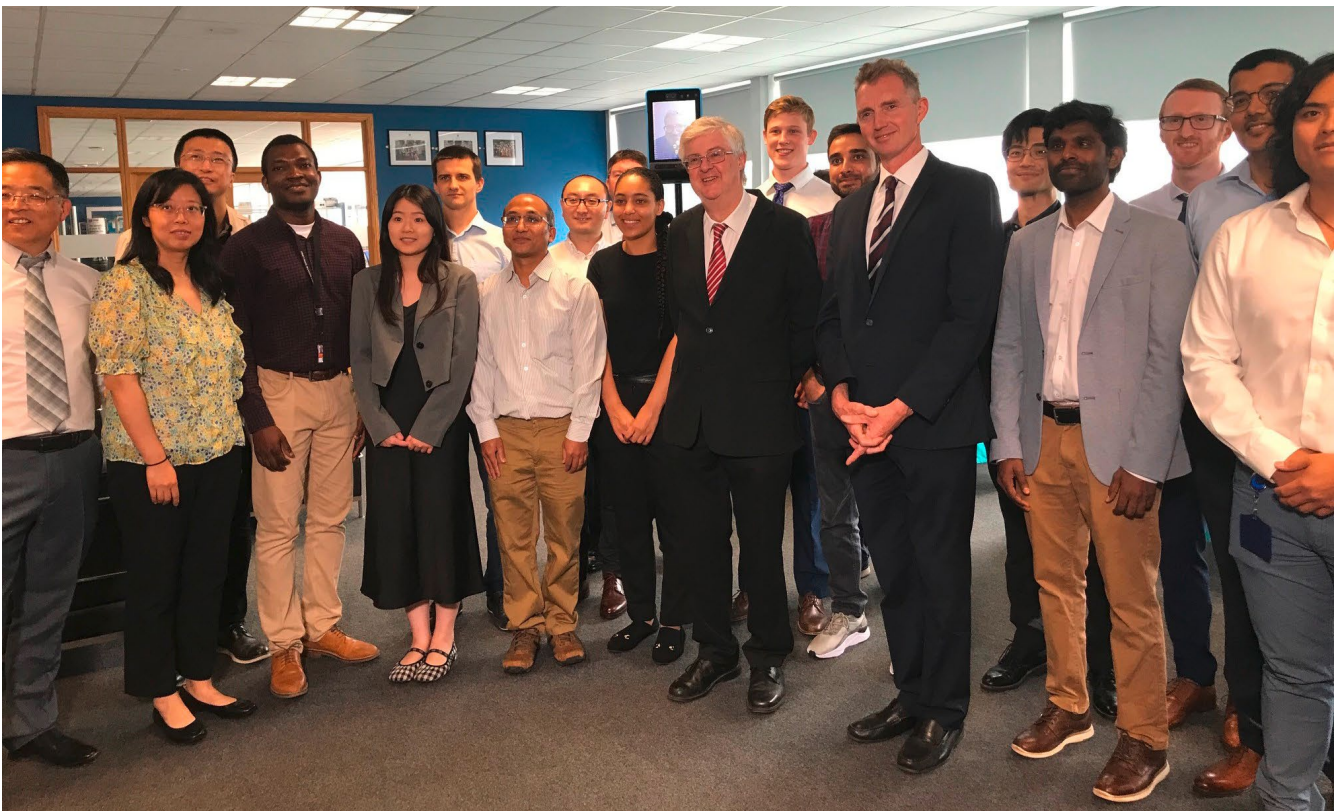
First Minister of Wales Rt Hon Mark Drakeford MS and the then UK Government Parliamentary Under-Secretary of State for Wales Rt Hon David TC Davies MP attend Bangor University's Digital Signal Processing Centre of Excellence in July. This is one of the projects receiving funding from the North Wales Growth Deal.

In September, the then Secretary of State for Education, the Rt Hon Kit Malthouse MP, spoke to the Scottish Cabinet Secretary for Education and Skills, Shirley-Anne Somerville MSP, the Minister for Education and Welsh Language, Jeremy Miles MS, and Michelle McIlveen MLA and Gordon Lyons MLA, the former Minister for Education and former Minister for the Economy respectively in the Northern Ireland Executive. The calls covered wide-ranging and important issues such as exams, higher education reforms and cost of living implication on education and children's services, including the support provided through the Energy Price Guarantee. There was agreement amongst all ministers to work together in the future on other shared priorities.