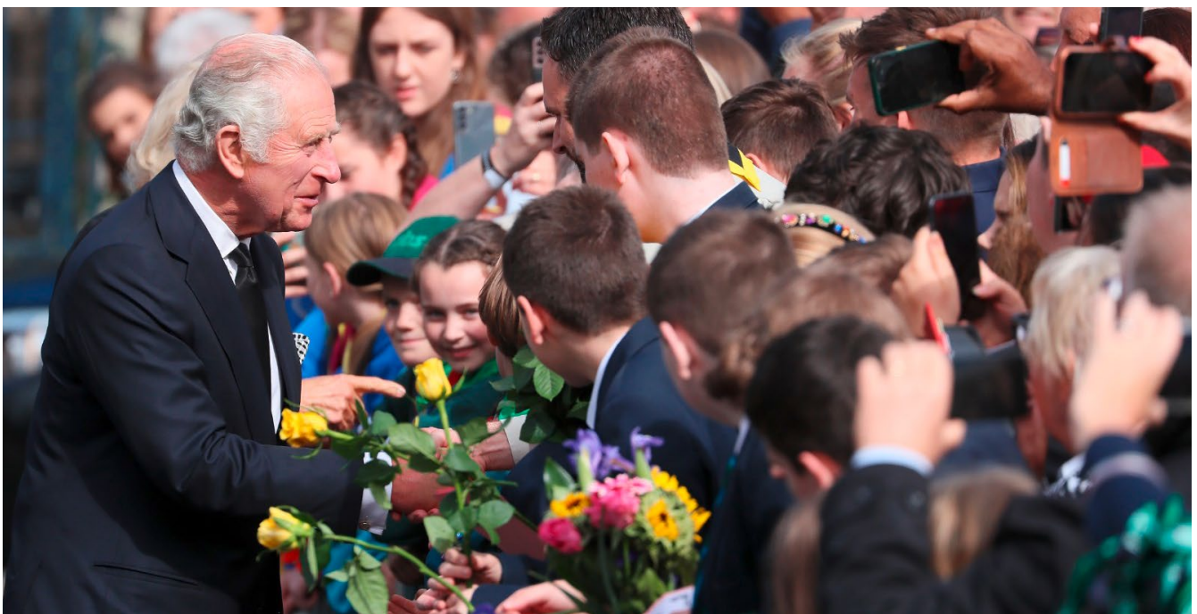
His Majesty The King and The Queen Consort greet crowds outside of Hillsborough Castle.