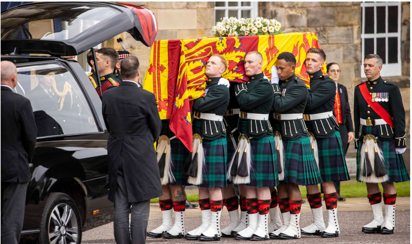
Pallbearers carry the coffin of Her Majesty Queen Elizabeth II, draped with the Royal Standard of Scotland outside the Palace of Holyroodhouse in Edinburgh.

Operation LONDON BRIDGE and Operation SPRING TIDE are the names given to the planning and delivery of the ten-day series of events following the sad announcement of the passing of Her Majesty The Queen and the succession of King Charles III respectively. These were truly a national effort. Years of advance planning brought together the UK, Scottish and Welsh governments, the NI Executive Office and the Northern Ireland, Scotland and Wales Offices, as well as local authorities, to deliver one of the largest and most complex events the UK has ever held. At a time of immense national sadness, and with the attention of many around the