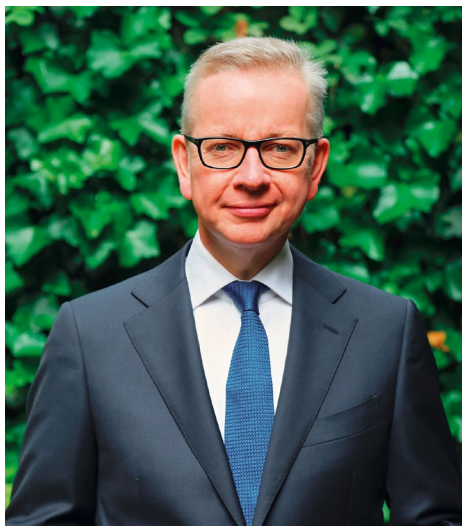
Rt Hon Michael Gove MP, Secretary of State for Levelling Up, Housing & Communities and Minister for Intergovernmental Relations

As we head into winter, we commit to working together to face the challenges that confront us at home and around the world.