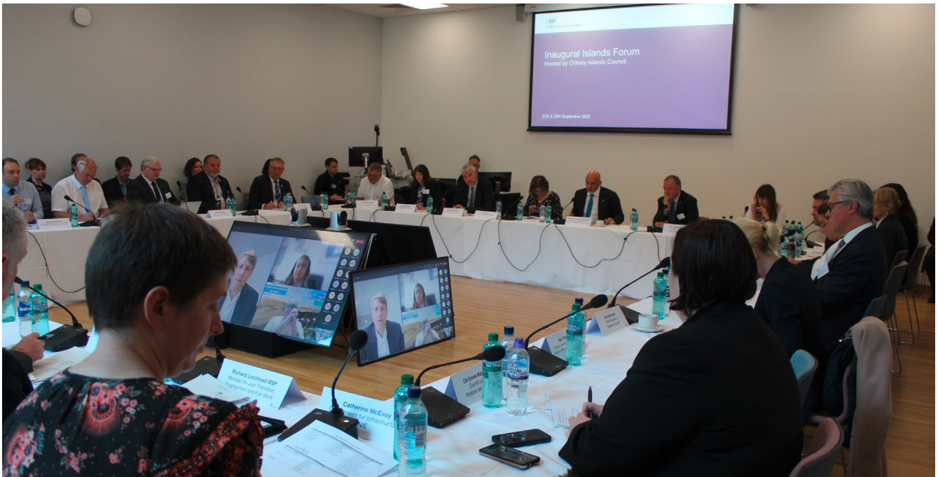
The first meeting of the Islands Forum held in Orkney in September, chaired by the then Chancellor of the Duchy of Lancaster, Rt Hon Nadhim Zahawi MP, attended by representatives from island communities, devolved administrations and UK Departments. Welsh Government Minister for Climate Change, Julie James MS attended remotely.