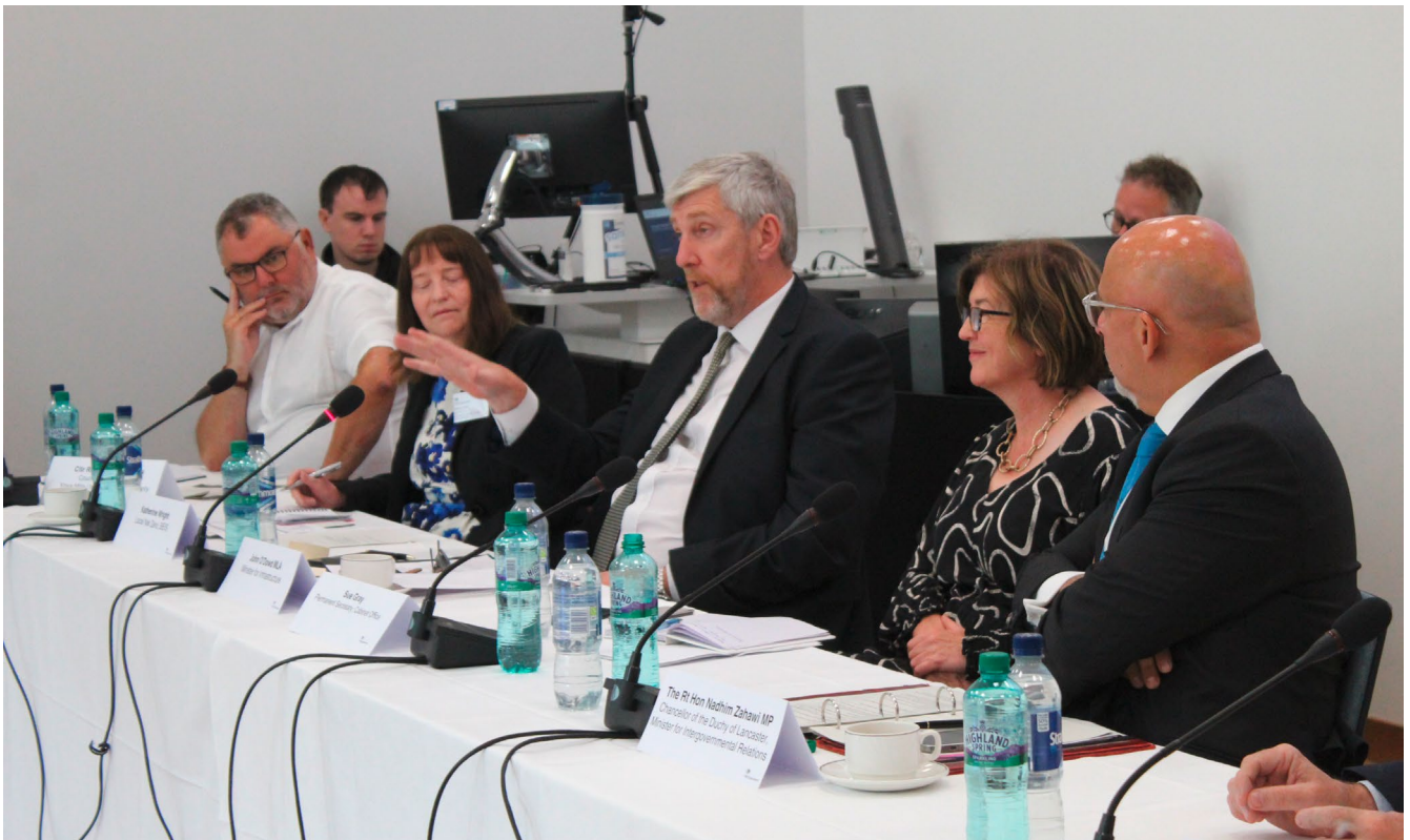
Former Northern Ireland Minister for Infrastructure John O'Dowd MLA, the Second Permanent Secretary to the Cabinet Office Sue Gray, and the then Chancellor of the Duchy of Lancaster Rt Hon Nadhim Zahawi MP talking at the Islands Forum in Orkney.