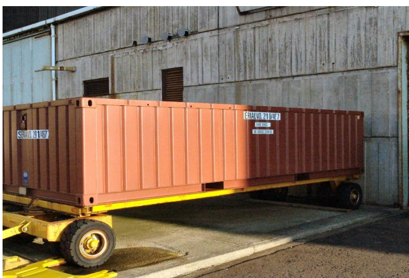
Photograph 2 - Example of a half-height ISO container awaiting transport from a Magnox Ltd site to the LLW Repository

Liquid radioactive effluent requiring disposal is transferred to the Active Effluent Treatment Plant (AETP) for processing and disposal. Once production of this effluent ceases the AETP will be decommissioned. This will be completed prior to entering the C&M phase.