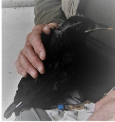
Photograph 11 - Chough chick being ringed on site by licensed ecologist in 2021

designated sites while at the same time positively improving chough feeding areas and potential nesting sites on the headland.