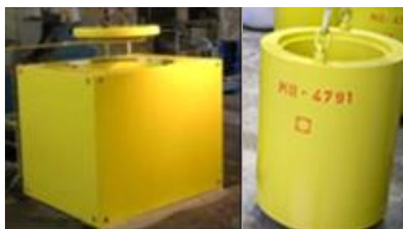
Photograph 9 - DCICs will be the chosen packaging for ILW at Wylfa

This project will support future management of Wylfa's ILW by characterising and quantifying the site's ILW inventory to support successful retrieval and packaging. This will inform the future storage requirements of a new ILW package Ductile Cast Iron Container (DCIC) storage facility to satisfy the long-term decay and storage strategy.