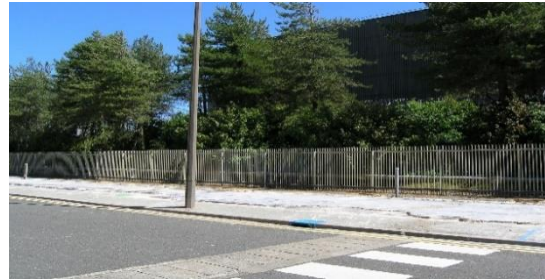
Photograph 5 - Breathing Apparatus (BA) Set & Training Facility – before and after demolition in 2022.