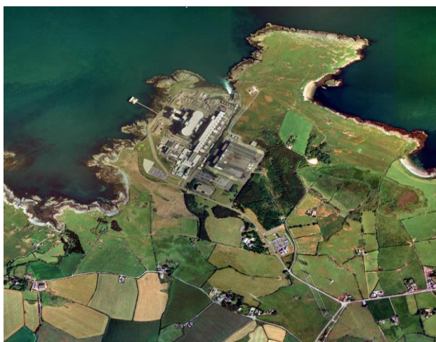
Photograph 1 - Aerial View of the Wylfa Site and Surrounding Landscape

The power station is bounded to the north, northeast, and northwest by the Irish Sea and to the southeast, south, and southwest by agricultural fields. The coast around the power station comprises rocky headlands with small bays, some of which are sandy. The approximate length of the coastline of the entire landholding is about 2km. The stretch immediately adjacent to the nuclear licensed site is approximately 750m. Close to the coast the land generally comprises rough grazing with exposed rock and gorse thickets. Farther inland the land comprises gently undulating, low lying farmland and isolated woodland, the latter mostly planted.