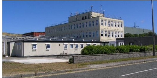
Photograph 6 - Administration Building Extension – before and after demolition in 2022.