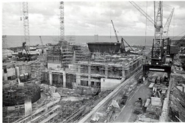
Photographs 12 & 13 - Wylfa during construction circa 1965

The impacts from noise, vibration and dust created during demolition activities will be managed to ensure their effects on the local community and environmental receptors are adequately controlled and minimised. Discussions with the IoACC Environmental Health Officer (EHO) have been conducted and all recommendations are to be implemented and managed in accordance with their advice and British Standard guidance. Monitoring will be employed to underpin the adequacy of controls and highlight deficiencies promptly; sampling thus far has shown that mitigations employed have been appropriate.