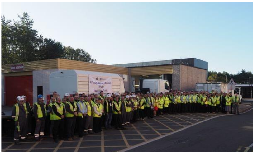
Photograph 4 - Staff at Wylfa gather in front of the final flask of spent fuel to leave site (September 2019)

Following completion of defueling and achieving fuel free verification in October 19 Wylfa has undergone transition to the Care and Maintenance Preparations phase of its lifecycle. This is the first stage of decommissioning and during this phase most of the radioactive and non-radioactive plant and buildings on site (other than the reactor building and possibly Secondary Dry Store Cells 4/5) will be dismantled and cleared.