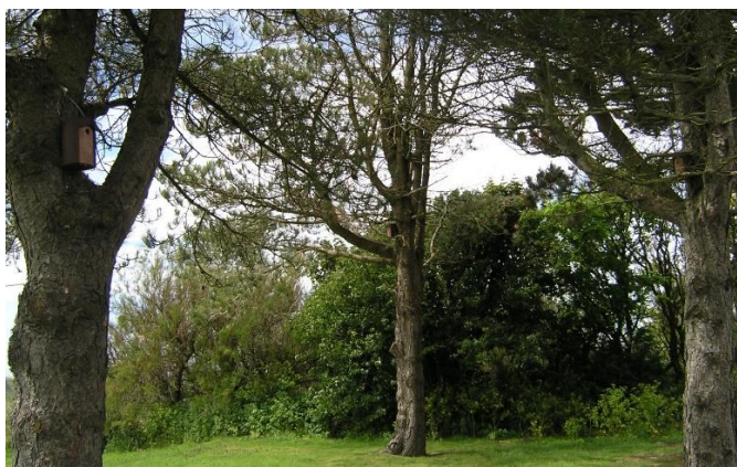
Photograph 10 – Bat & Bird boxes erected at Wylfa site in 2022

Ecological mitigations have been implemented this year informed by numerous surveys conducted on areas highlighted for demolition. These mitigations include the installation of bat and bird boxes located on site to support the relocation of bats potentially affected by the imminent decommissioning work. It has also been recognized that liaison with NRW and a qualified ecologist will be required to ensure the appropriate wildlife licensing is obtained prior to specific work activities.