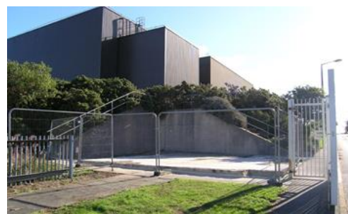
Photograph 8 – The Old Security Lodge – before and after demolition in 2022.

A number of 'Prior Notification' applications for this work have been made to the IoACC in 2021/22 and these submissions approved as 'Permitted Development' thereafter. This significant milestone has now allowed the demolition/removal of these buildings at Wylfa, and physical work is progressing and scheduled to continue next year.