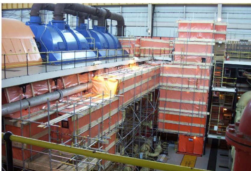
Photograph 3 - Turbine Hall Asbestos removal at Hinkley Point A Site

Non-radioactive asbestos will be double bagged in its wet state after stripping; hence there will be no liquid waste to be processed from the removal operation itself. Non-radioactive asbestos will be sent to off-site licensed asbestos disposal sites. Radioactive asbestos, which will be LLW, will be sent to a super-compaction facility, with the wastewater produced by this process being filtered to remove any asbestos fibres before the compacted asbestos is sent to the LLW repository near Drigg. Radioactive asbestos which can be characterised as very low-level radioactive waste (VLLW) can be disposed of to alternate suitably licensed disposal facilities.