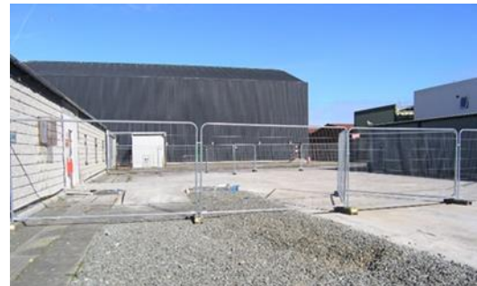
Photograph 7 – Engineering Branch Offices – before and after demolition in 2022.