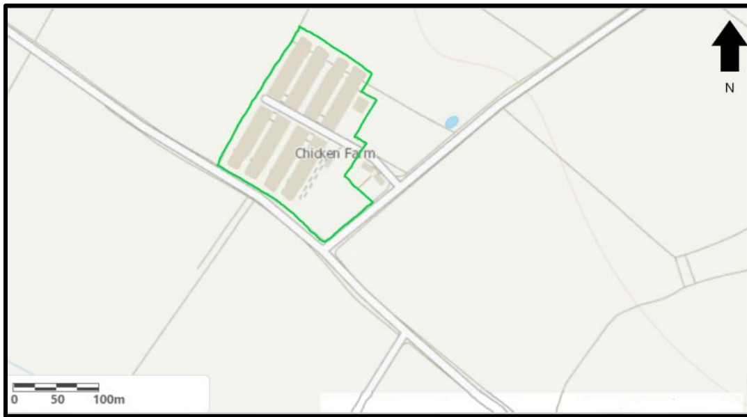
Site layout plan

Site plan - showing installation boundary as referred to in condition 2.2.1.