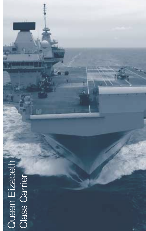
Queen Elizabeth Class Carrier