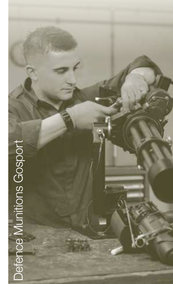
Defence Munitions Gosport