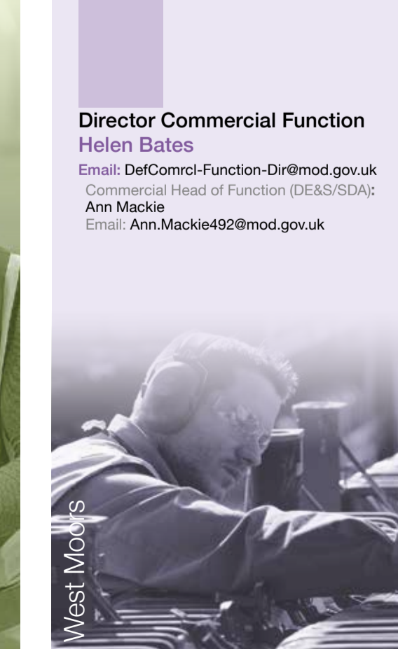
Defence Munitions Gosport