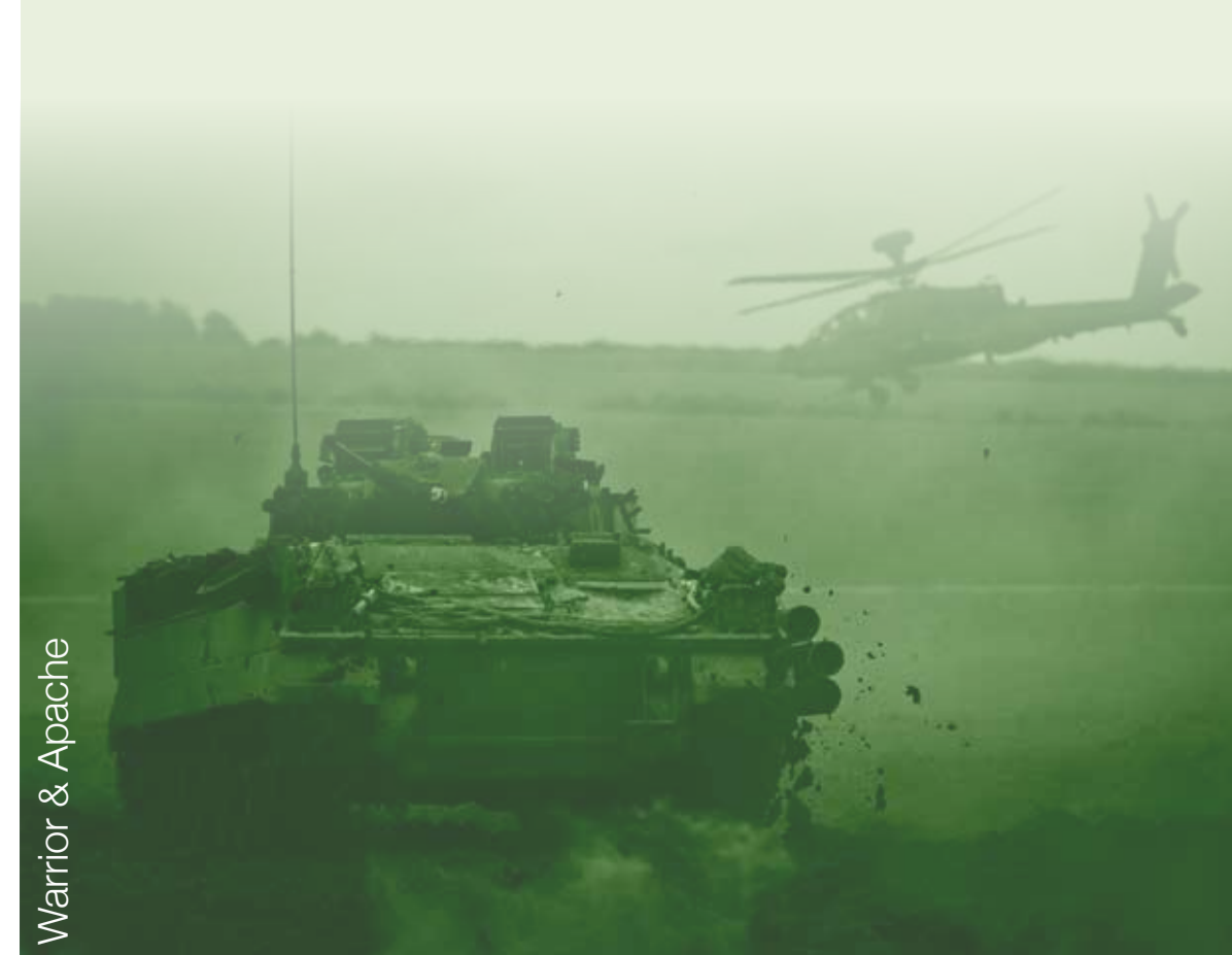
Warrior & Apache