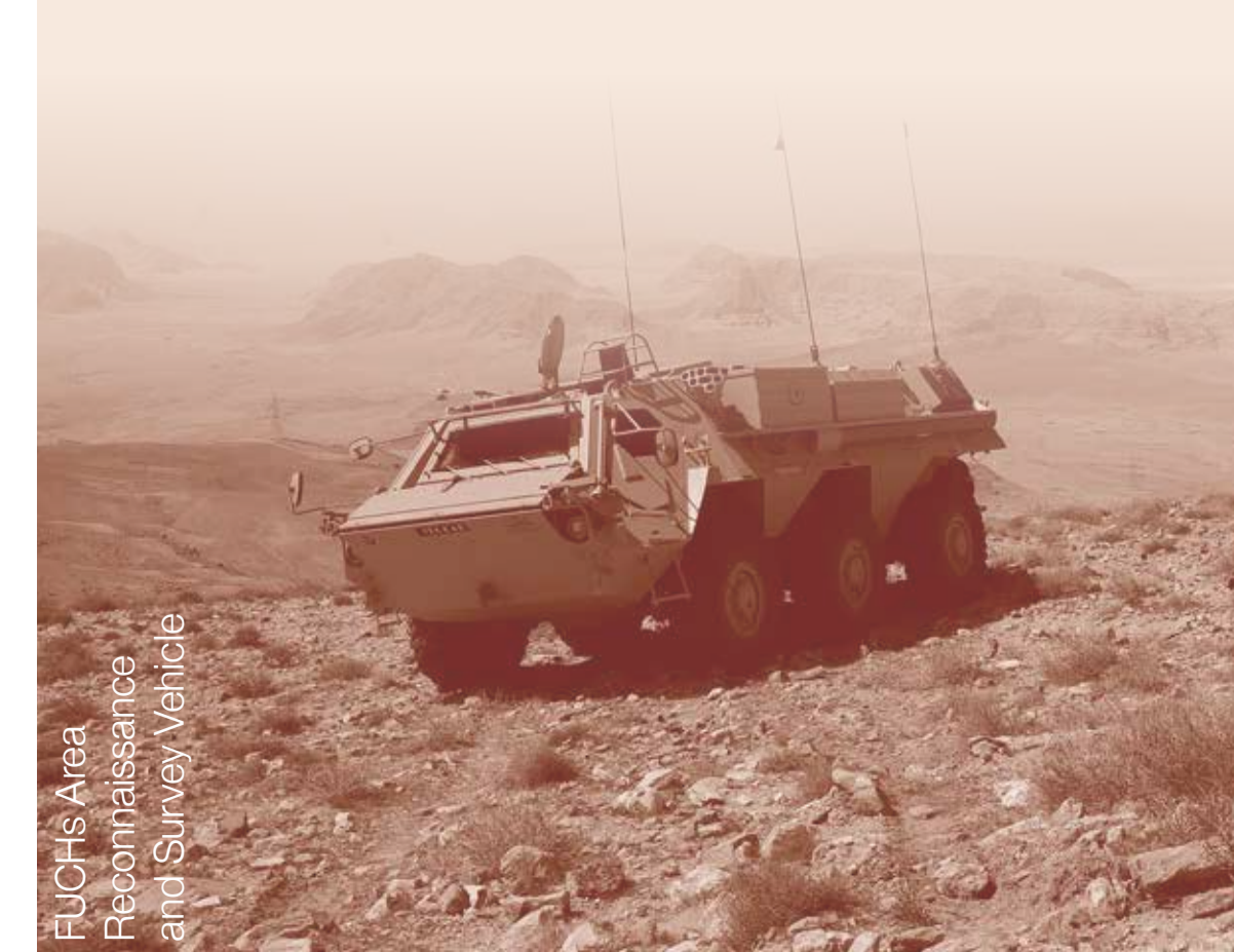
Fuchs Area Reconnaissance and Survey Vehicle