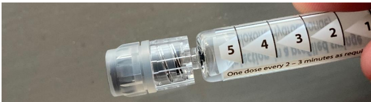
Image detailing the clear plastic cap at the end of the pre-filled syringe that must remain intact in order to maintain sterility of the medicinal product