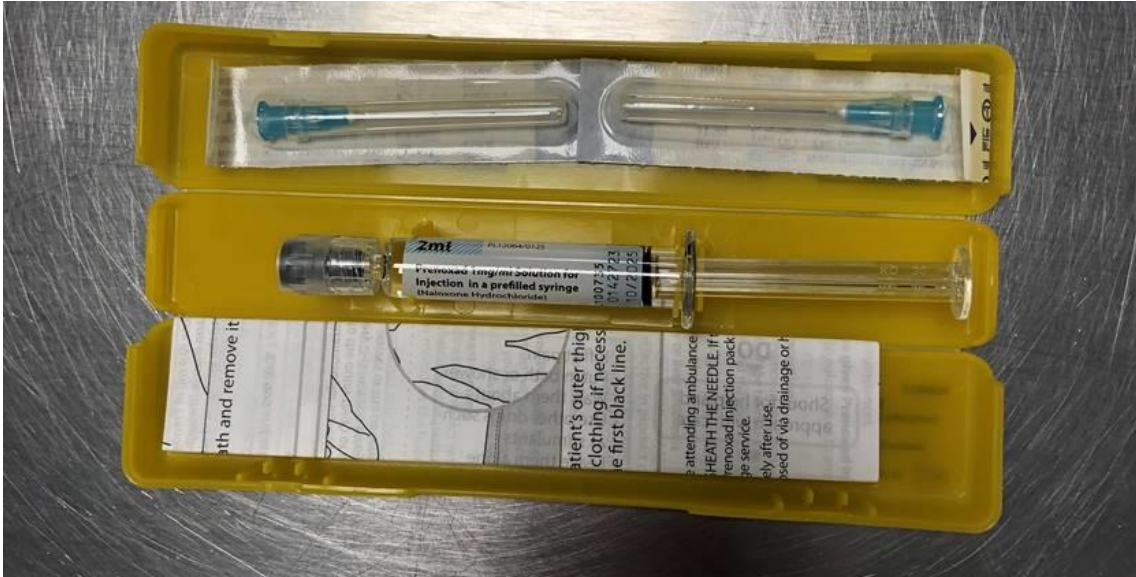
Two (2) Terumo 23 gauge 1¼ inch needles

Contents of an opened kit. Prenoxad kits are packed with two (2) Terumo 23 gauge 1¼ inch needles, along with the pre-filled syringe containing the active ingredient (naloxone hydrochloride), and a Patient Information Leaflet