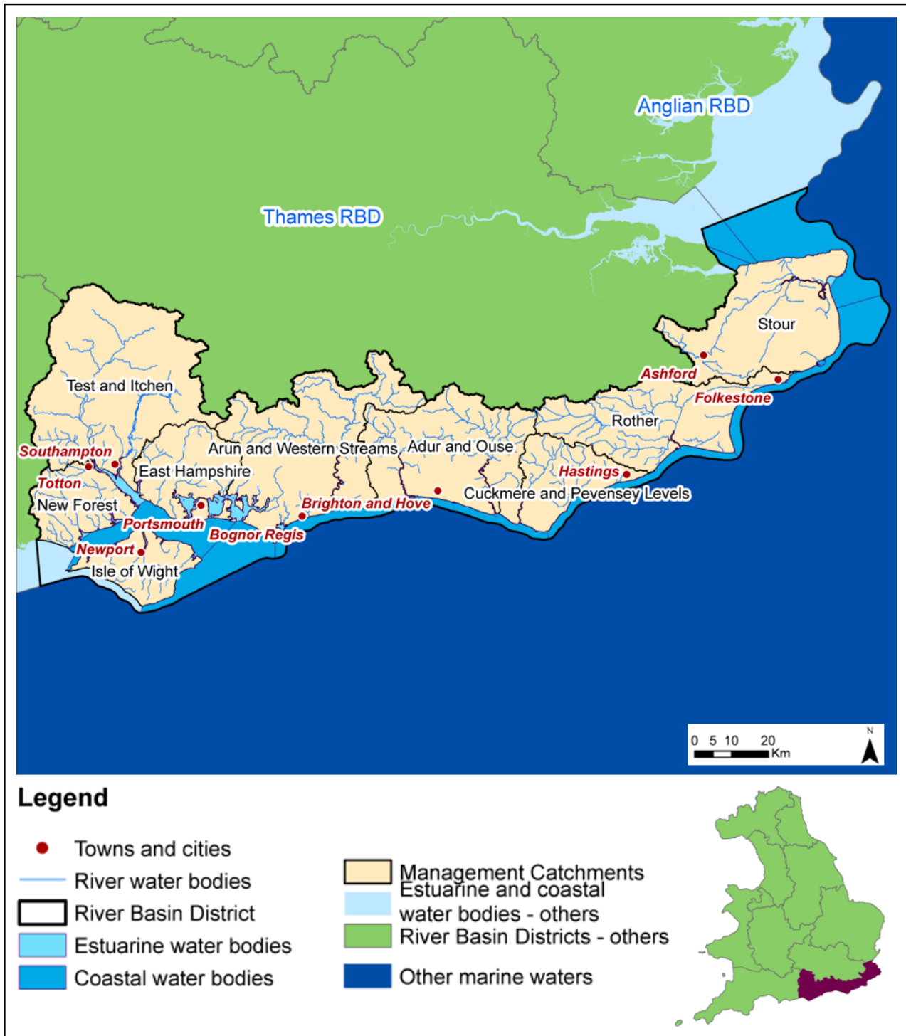
Figure 1 Map of the South East RBD and management catchments

© Crown Copyright and database rights 2015. Ordnance Survey 100024198. © Environment agency copyright and/or database rights 2015. All rights reserved.