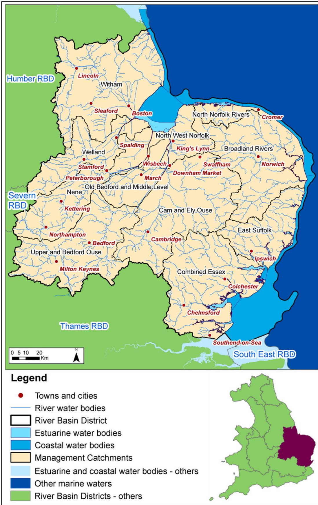
Figure 1 Map of the Anglian RBD and management catchments