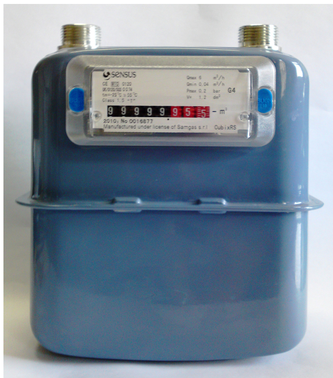
Photograph Showing Complete G4 1.2dm 3 Meter with 110mm Boss Spacing