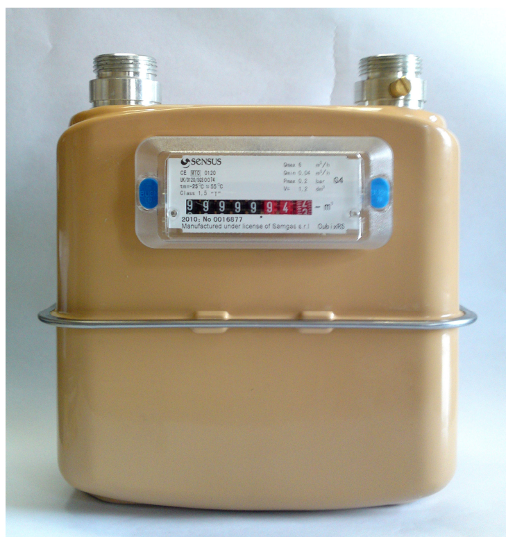
Photograph Showing Complete G4 1.2dm 3 Meter with 152.4mm Boss Spacing