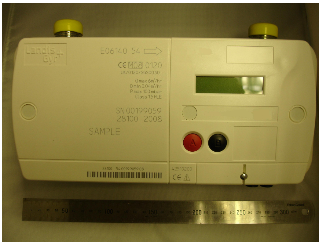
Photograph of Meter without Module Fitted